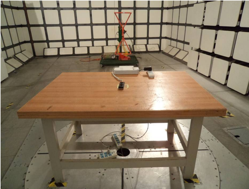
Radiated Emissions - Rear View (30-1000 MHz)