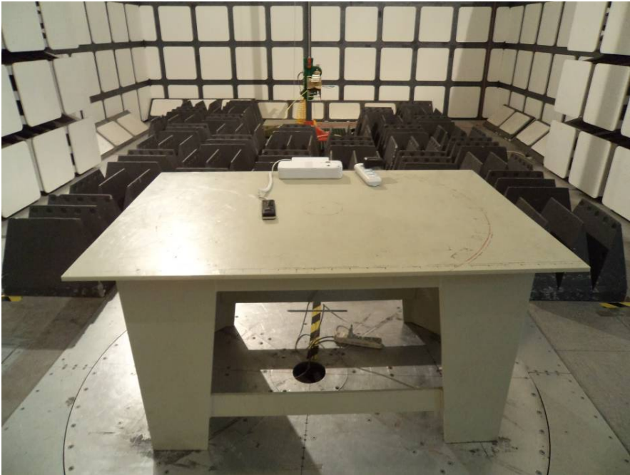
Radiated Emissions - Rear View (1-25 GHz)