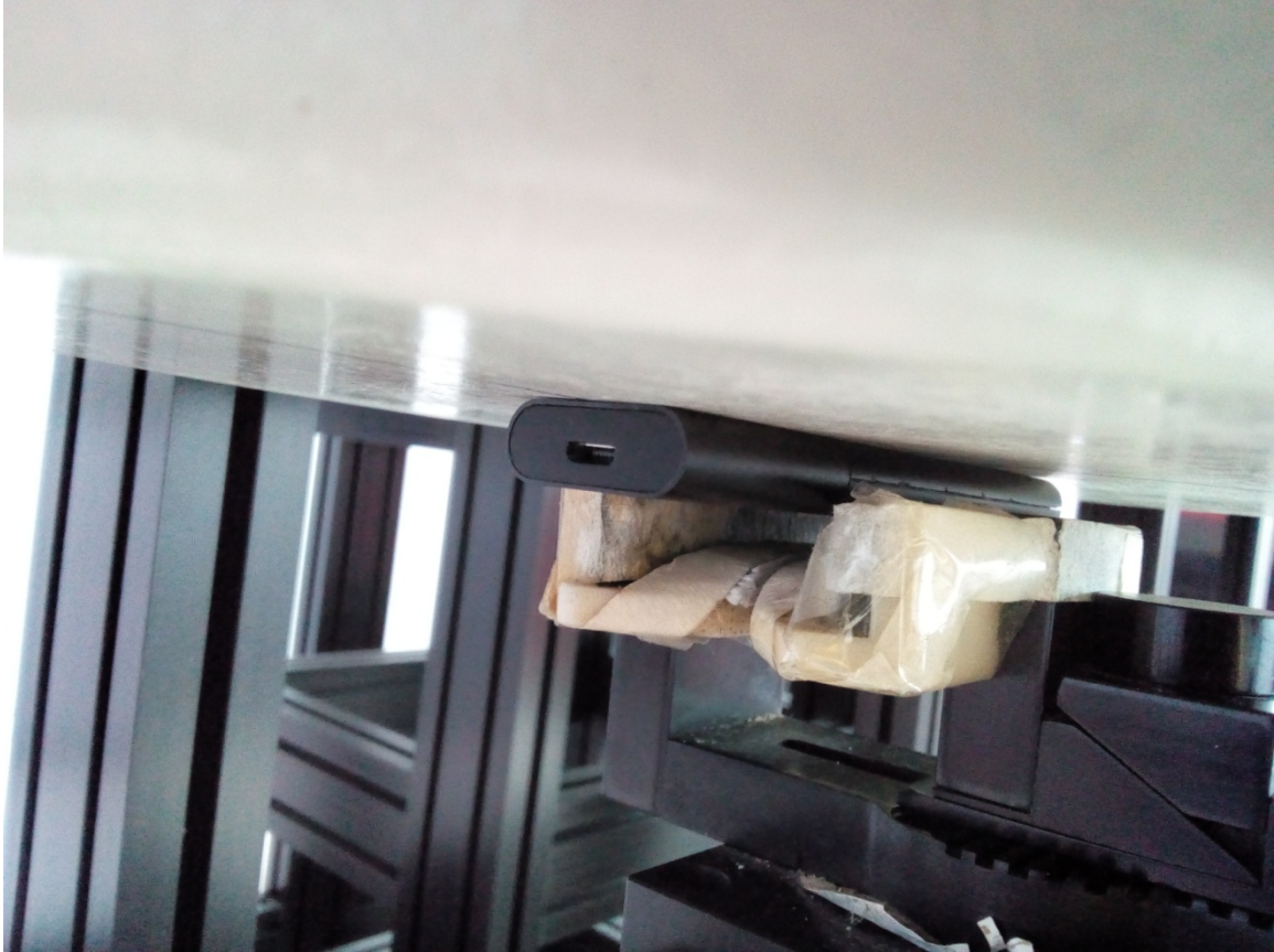
Body Left Setup Photo (0mm)