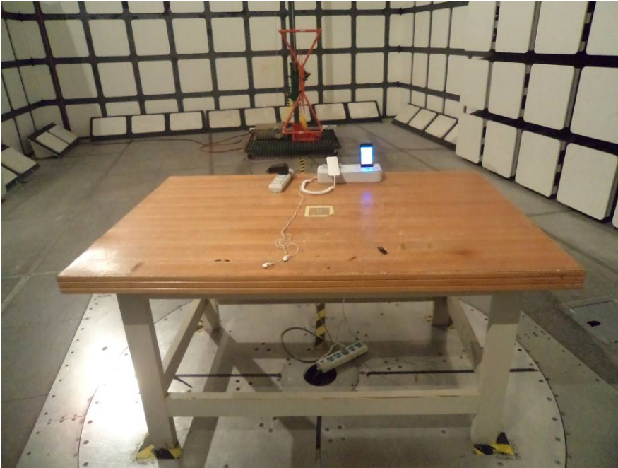
Radiated Emissions - Rear View (30-1000 MHz)