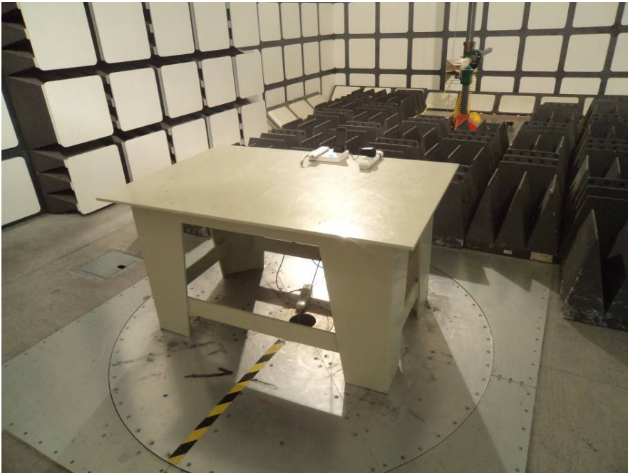
Radiated Emissions - Rear View (1-25 GHz)