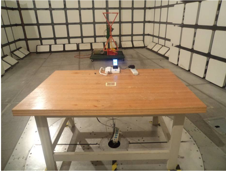
Radiated Emissions - Rear View (30-1000 MHz)