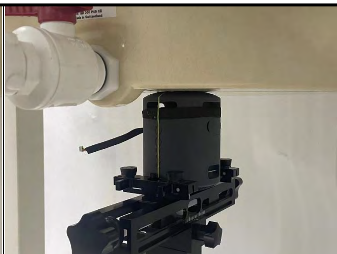
Bottom Side of EUT with 0 cm Gap