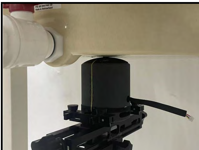
Top Side of EUT with 0 cm Gap