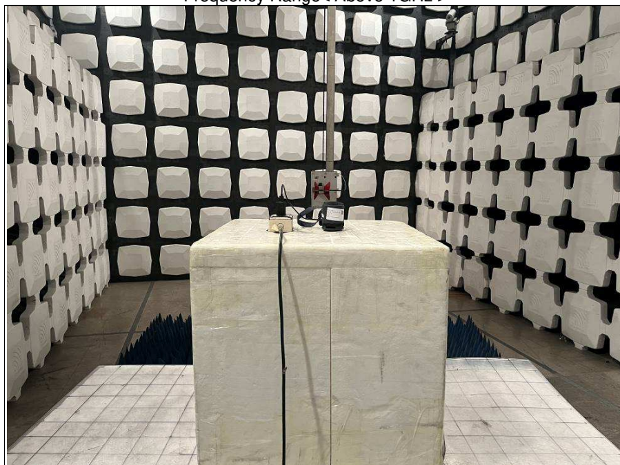
Frequency Range < Above 1GHz >