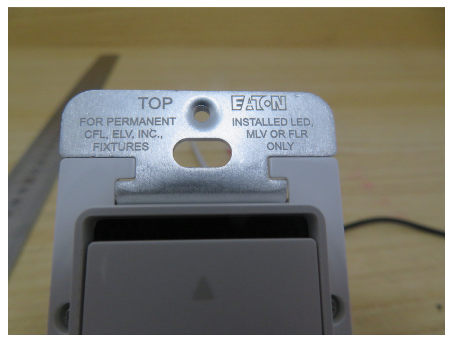
View of EUT-4