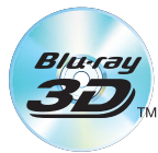
BLU-RAY 3D MOVIE