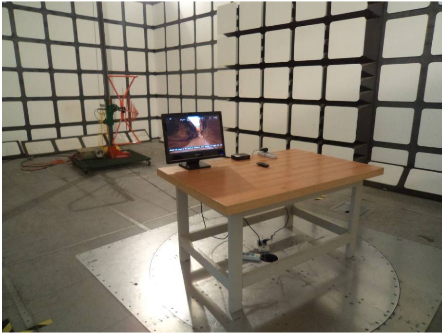
Radiated Emission - Rear View (30 MHz-1000 MHz)