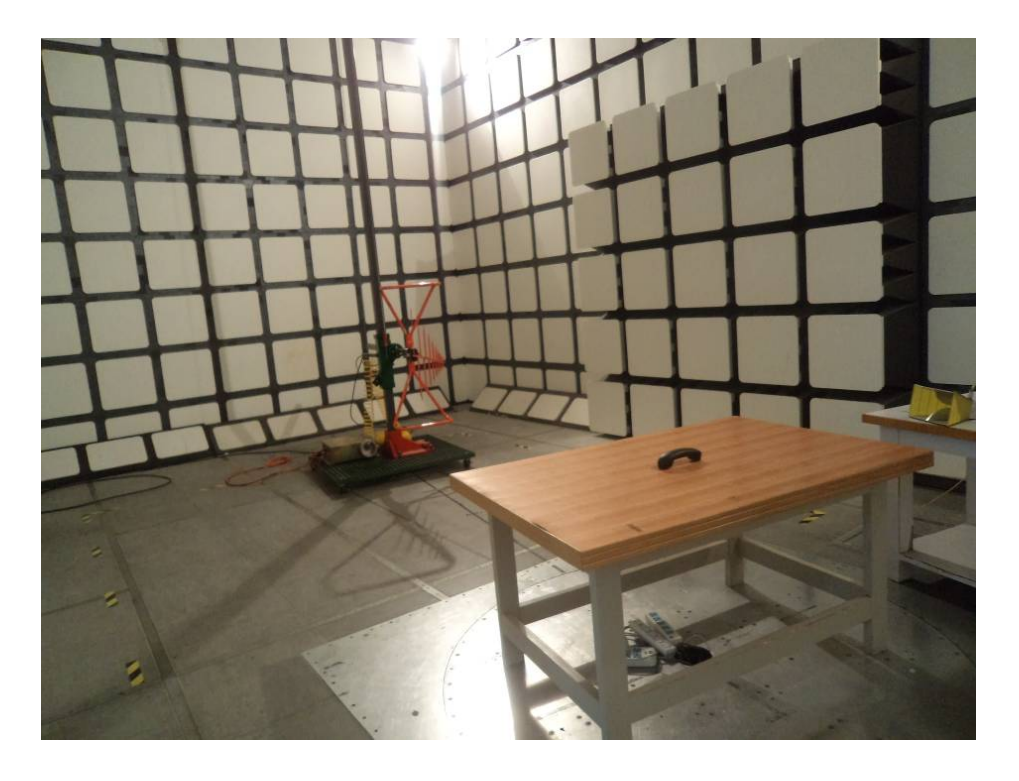
Radiated Emissions - Rear View (30-1000 MHz)