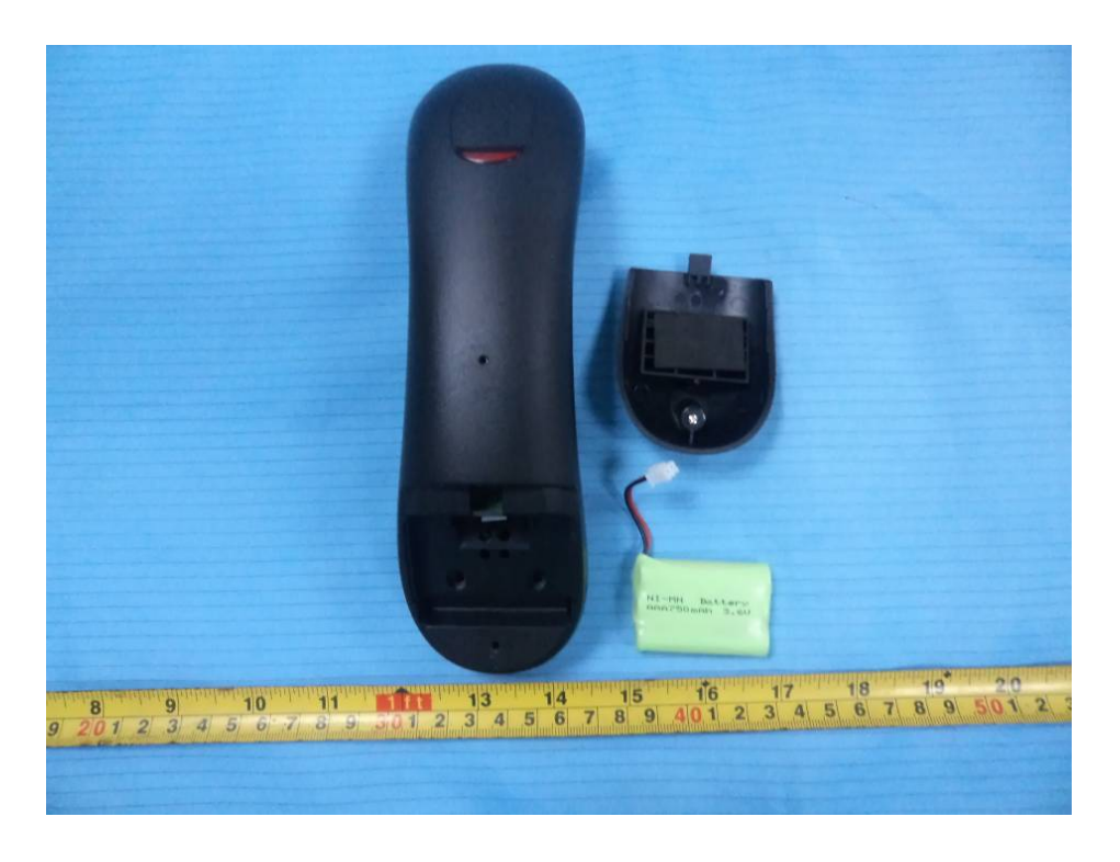
EUT – Cover off View