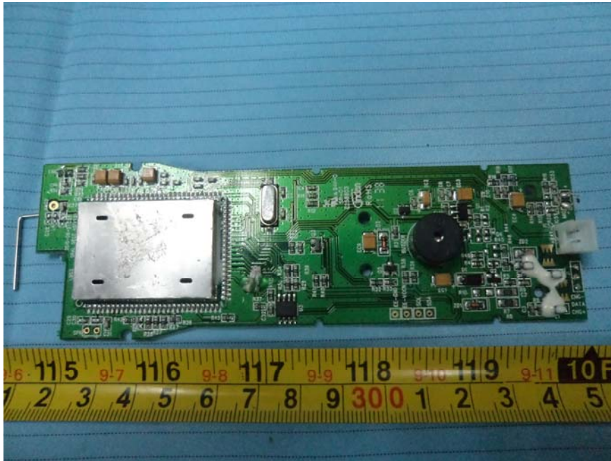
EUT – Main Board Top Shielding off View