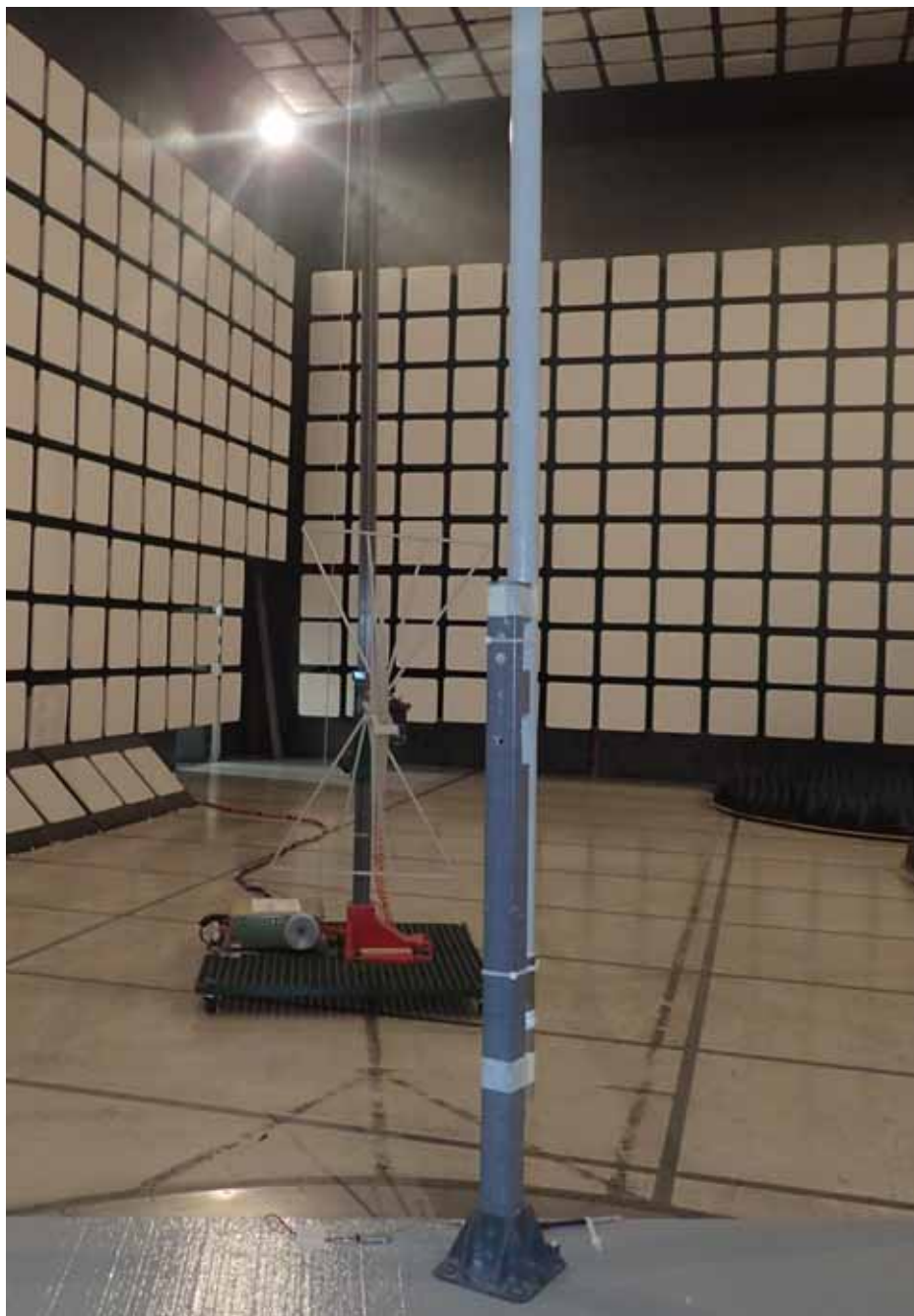
Radiated Emissions @ 3 m, Orthogonal Position 1 EUT with 8.0 dBi Omni-directional Antenna