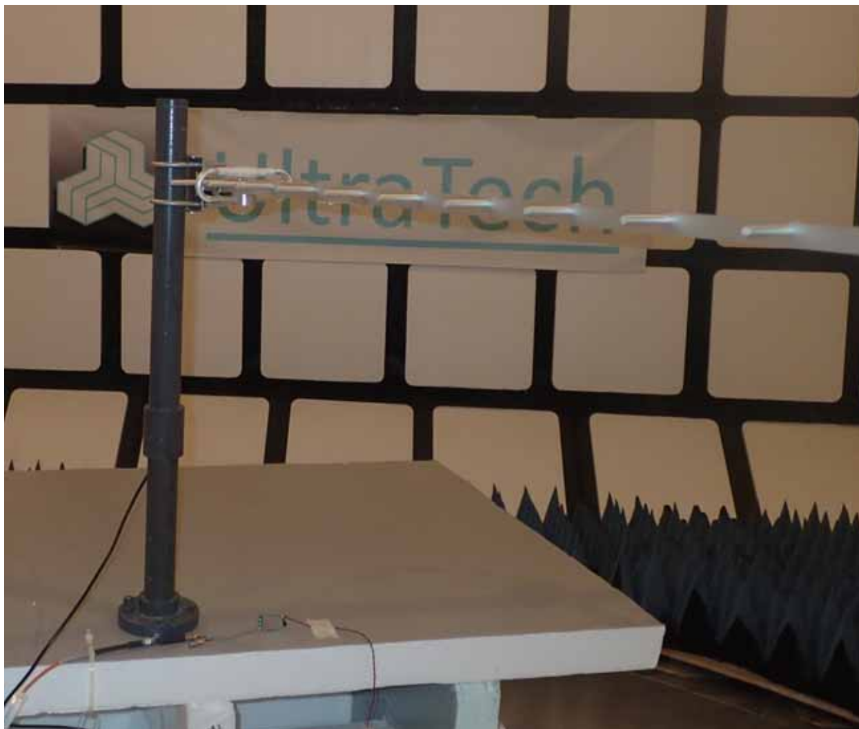
Radiated Emissions @ 3 m, Orthogonal Position 2 EUT with 14.0 dBi Yagi Antenna