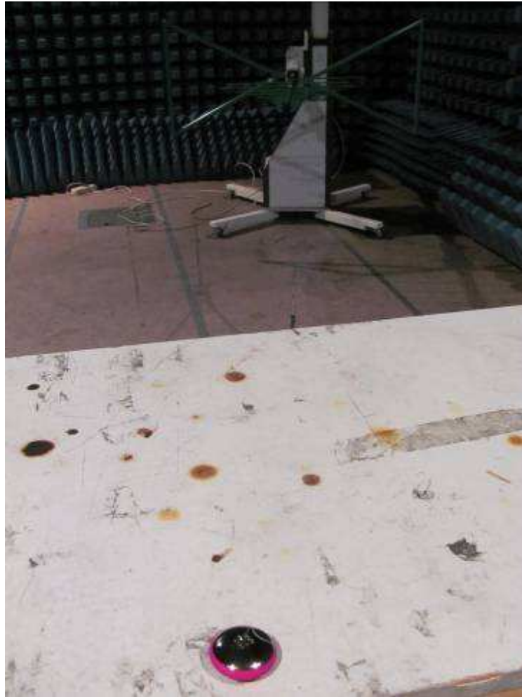
30MHz-1000MHz, X axis