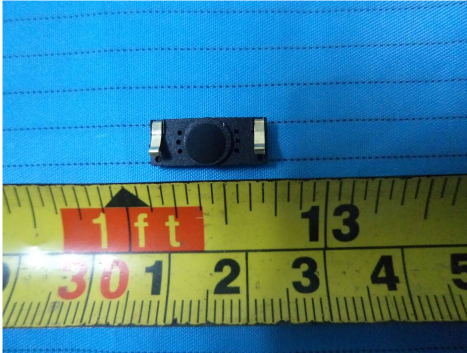
EUT – Antenna View