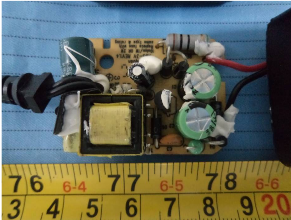
EUT – Adapter Main Board Top View