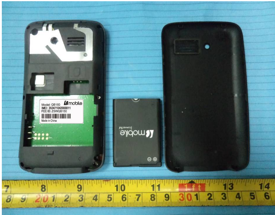
EUT – Cover off View