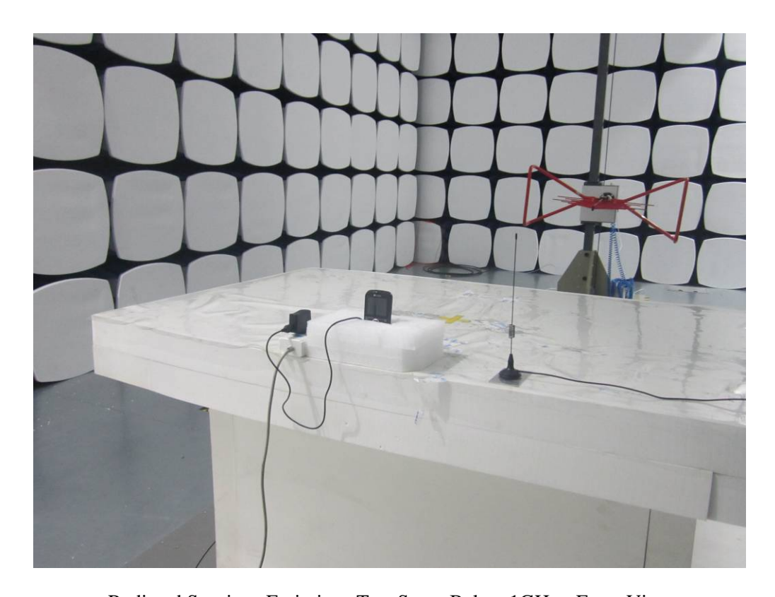
Radiated Spurious Emissions Test Setup Below 1GHz - Front View