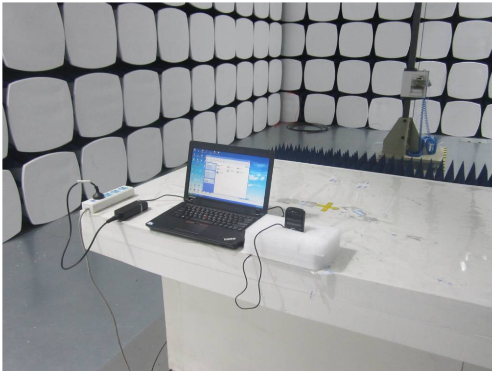
Radiated Spurious Emissions Test Setup Above 1GHz –Front View