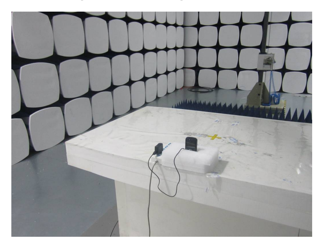
Radiated Spurious Emissions Test Setup Above 1GHz -Front View