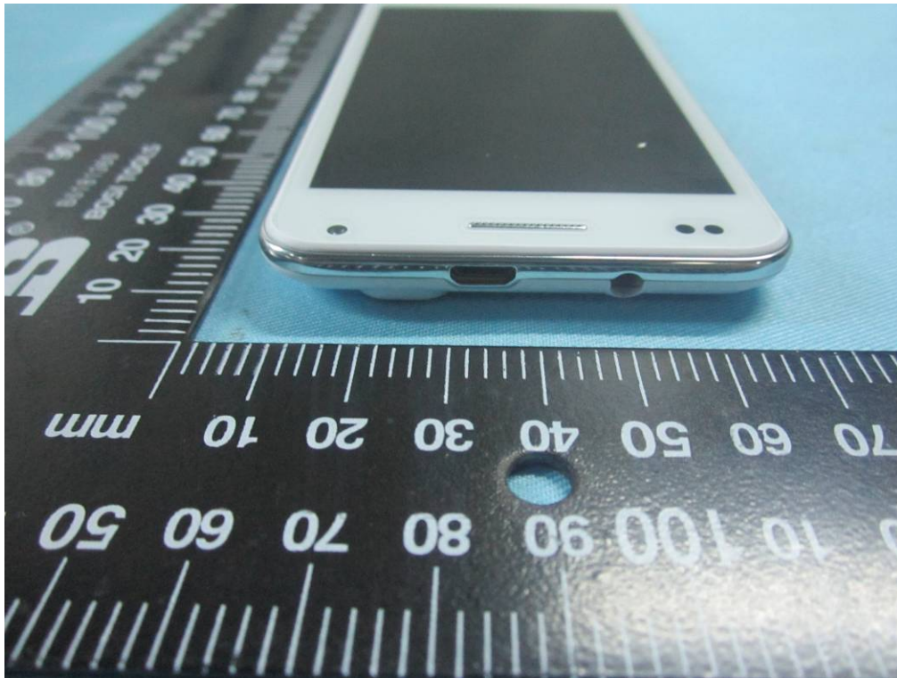
EUT - Top View

Report No.: 14070034-FCC-E1 Issue Date: June 06, 2014 Page: 21 of 37 www.siemmic.com www.sinnmic.com.cn