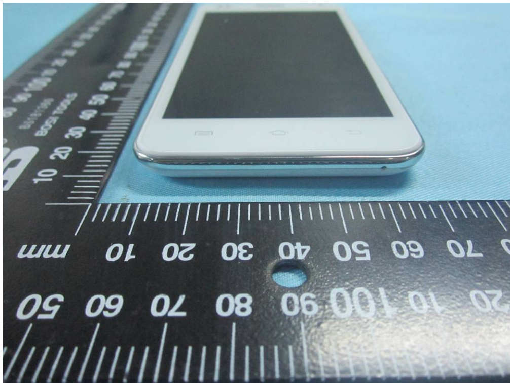
EUT - Bottom View