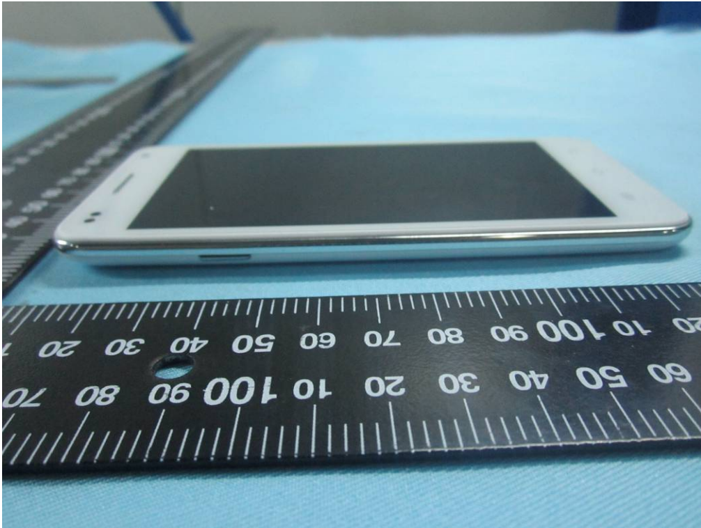
EUT - Left View

Report No.: 14070034-FCC-E1 Issue Date: June 06, 2014 Page: 22 of 37 www.siemic.com www.sinmic.com.cn