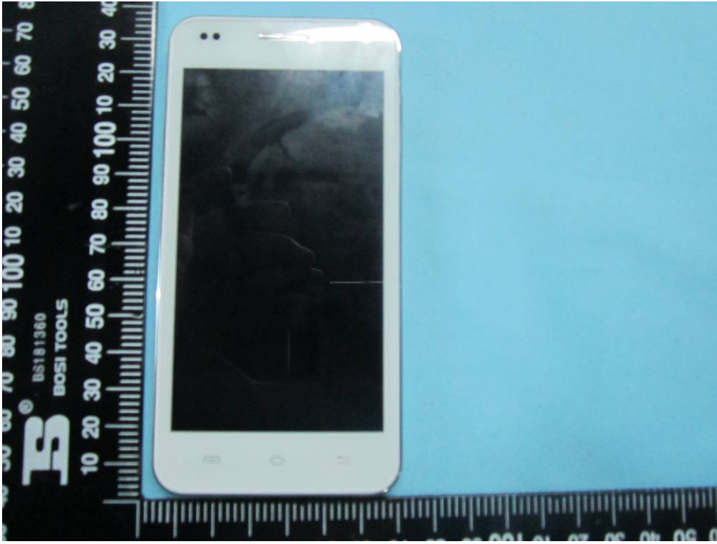
EUT - Front View