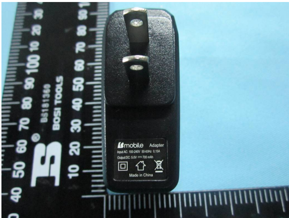
Adapter – Front View