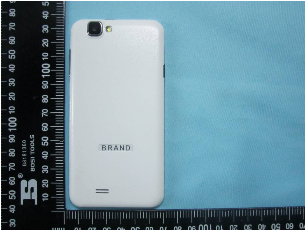
EUT - Rear View