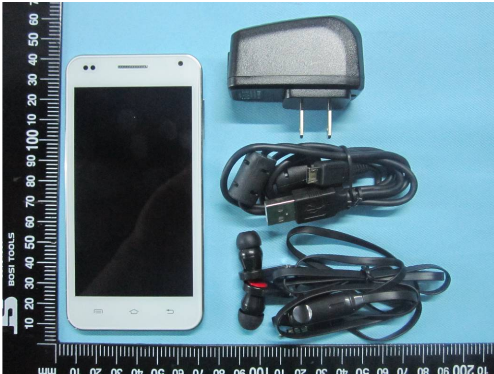
Whole Package - Top View