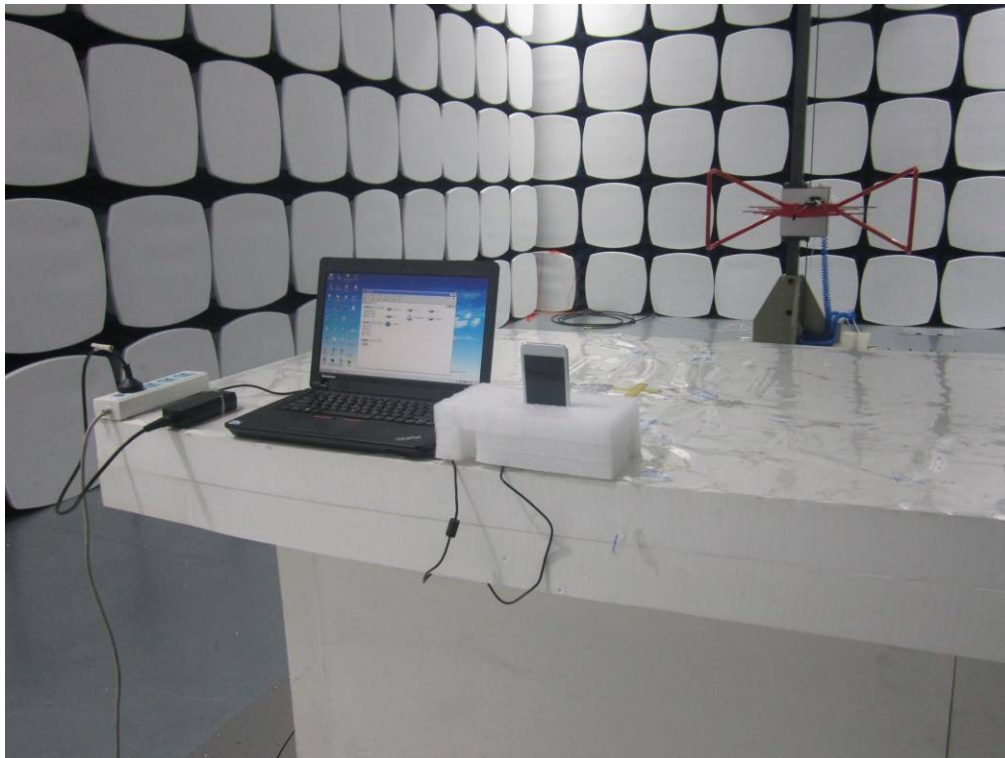
Radiated Spurious Emissions Test Setup Below 1GHz - Front View

Report No.: 14070034-FCC-E1 Issue Date: June 06, 2014 Page: 31 of 37 www.siemic.com www.sinmic.com.cn