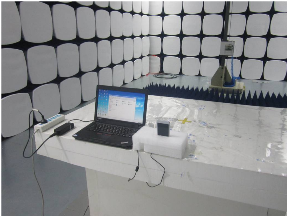
Radiated Spurious Emissions Test Setup Above 1GHz –Front View