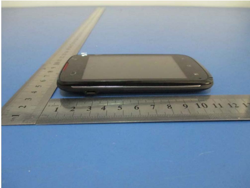
EUT - Left View

Report No.: 13050011-FCC-E Issue Date: April 28, 2013 Page: 22 of 35 www.siemic.com.cn