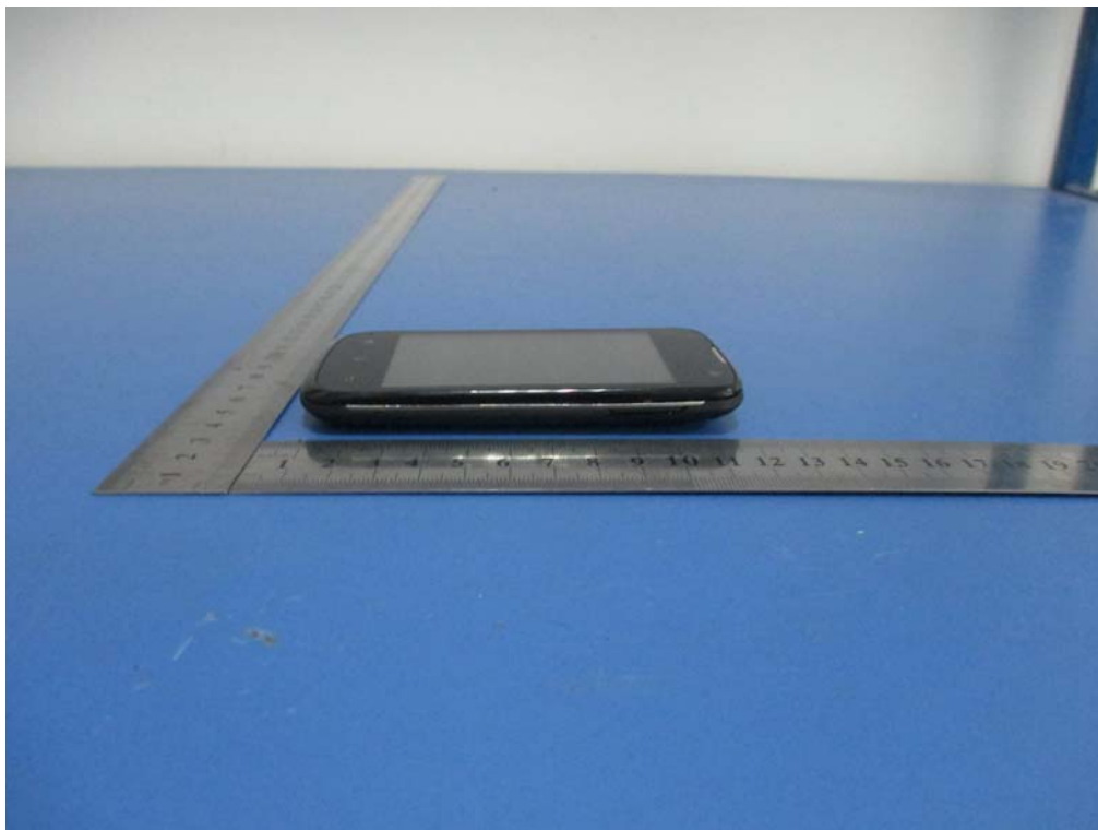
EUT - Right View