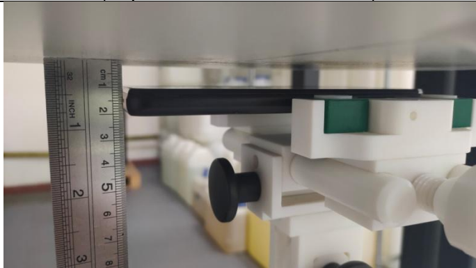
Front Side (Separation distance of 10mm)