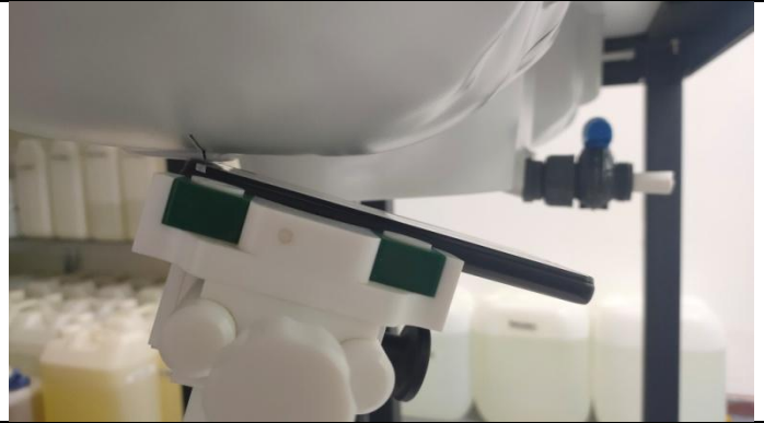
Right Tilt 15 Degree