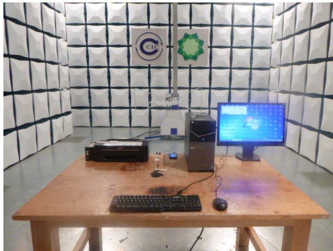
Radiated Emission (above 1GHz) Connect to PC