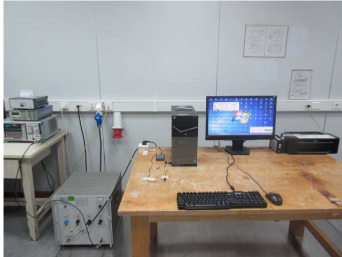
Radiated Emission (30MHz-1GHz) Connect to PC