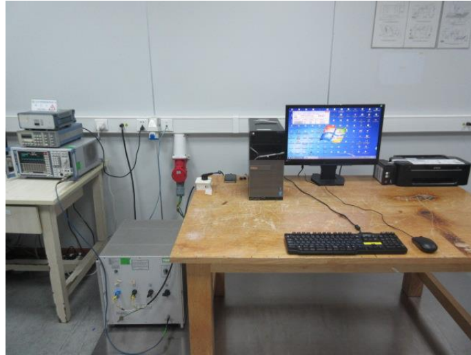
Radiated Emission (30MHz-1GHz) Connect to PC