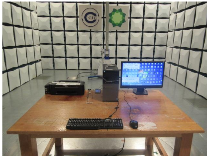
Radiated Emission (above 1GHz) Connect to PC