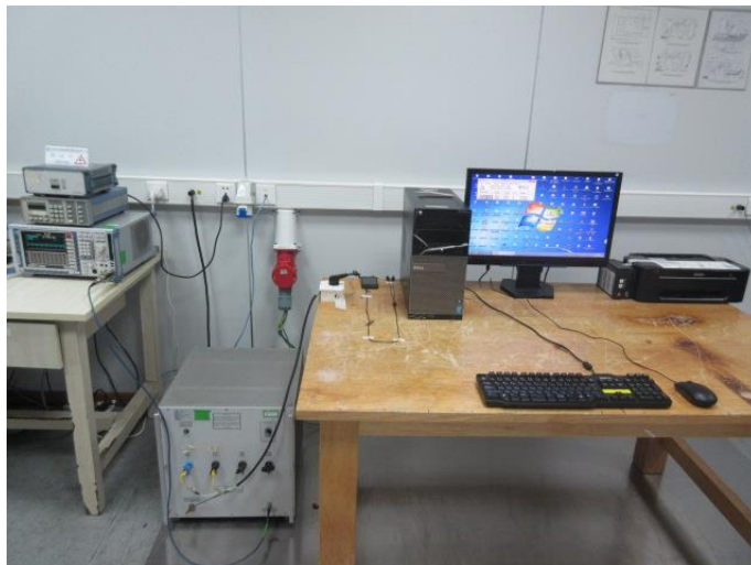
Radiated Emission (30MHz-1GHz) Connect to PC