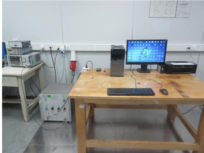
Radiated Emission (30MHz-1GHz) Connect to PC