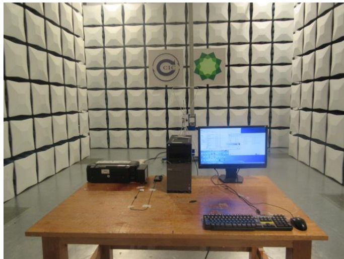
Radiated Emission (above 1GHz) Connect to PC