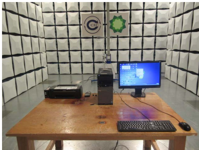
Radiated Emission (above 1GHz) Connect to PC