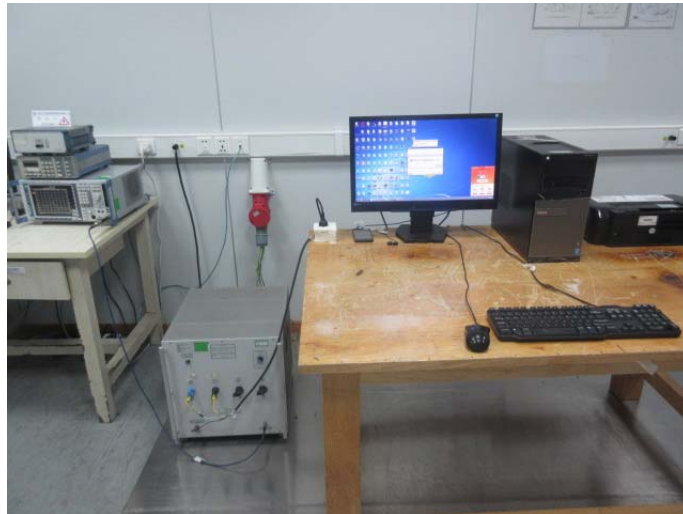
Radiated Emission (30MHz-1GHz) Connect to PC