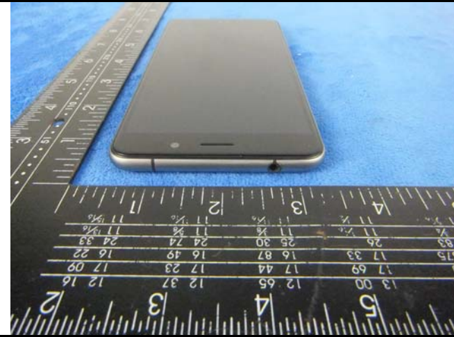
EUT - Top View