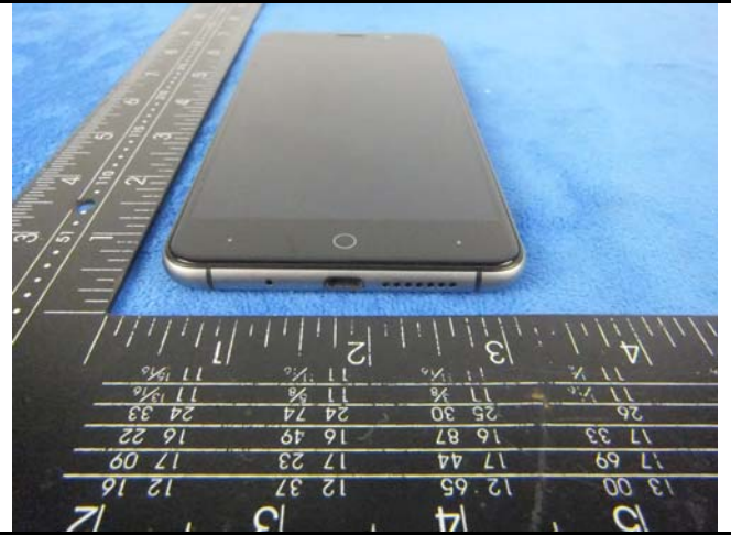
EUT - Bottom View