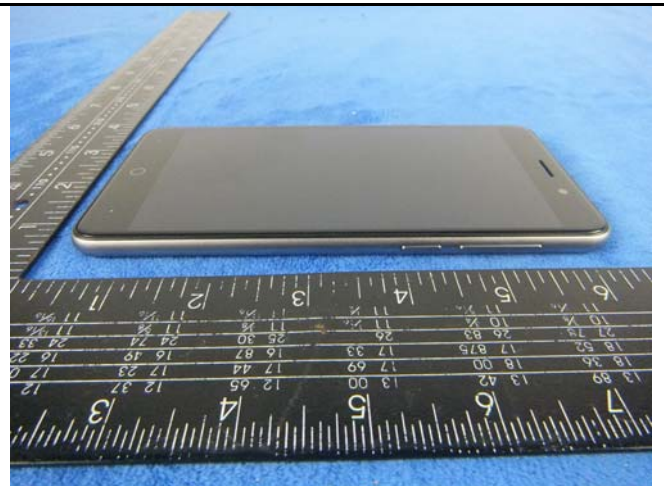
EUT - Right View