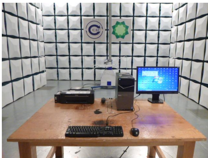
Radiated Emission (above 1GHz) Connect to PC