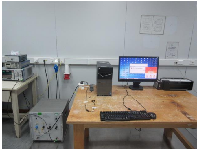
Radiated Emission (30MHz-1GHz) Connect to PC