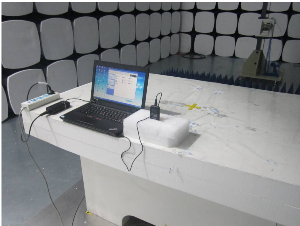
Radiated Spurious Emissions Test Setup Above 1GHz –Front View