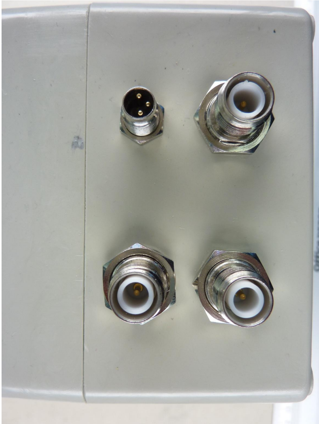
161597_c.JPG: ZONESCAN 820 Solar Alpha, detail view to connectors