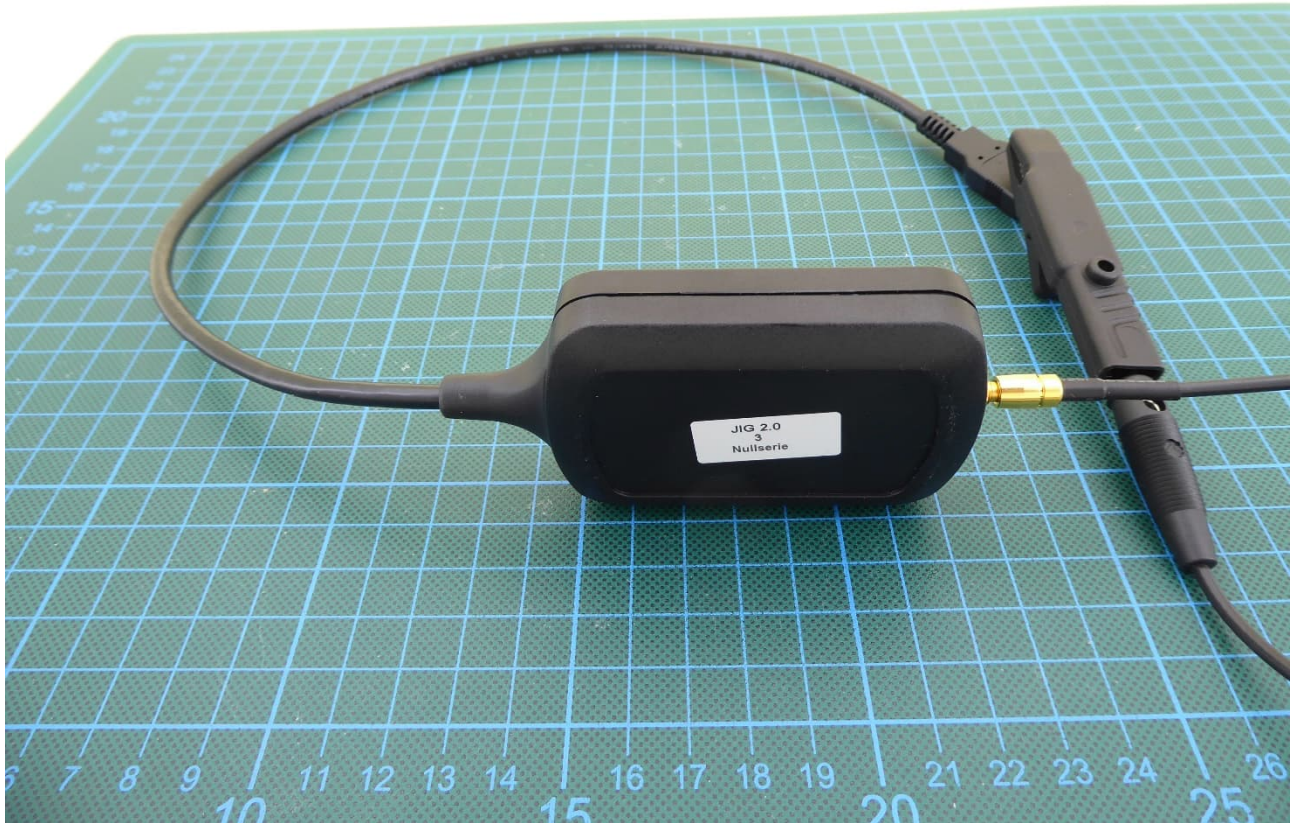
Programming jig view 1