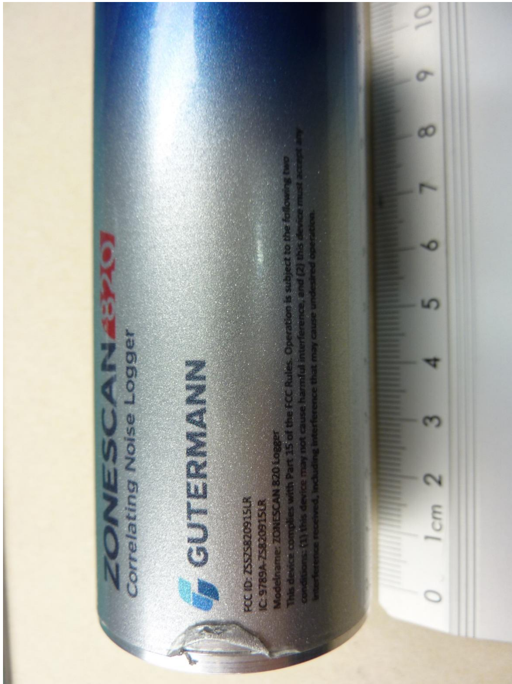
153494_X_U_3.JPG: ZONESCAN 820 Logger with external antenna port, type plate view