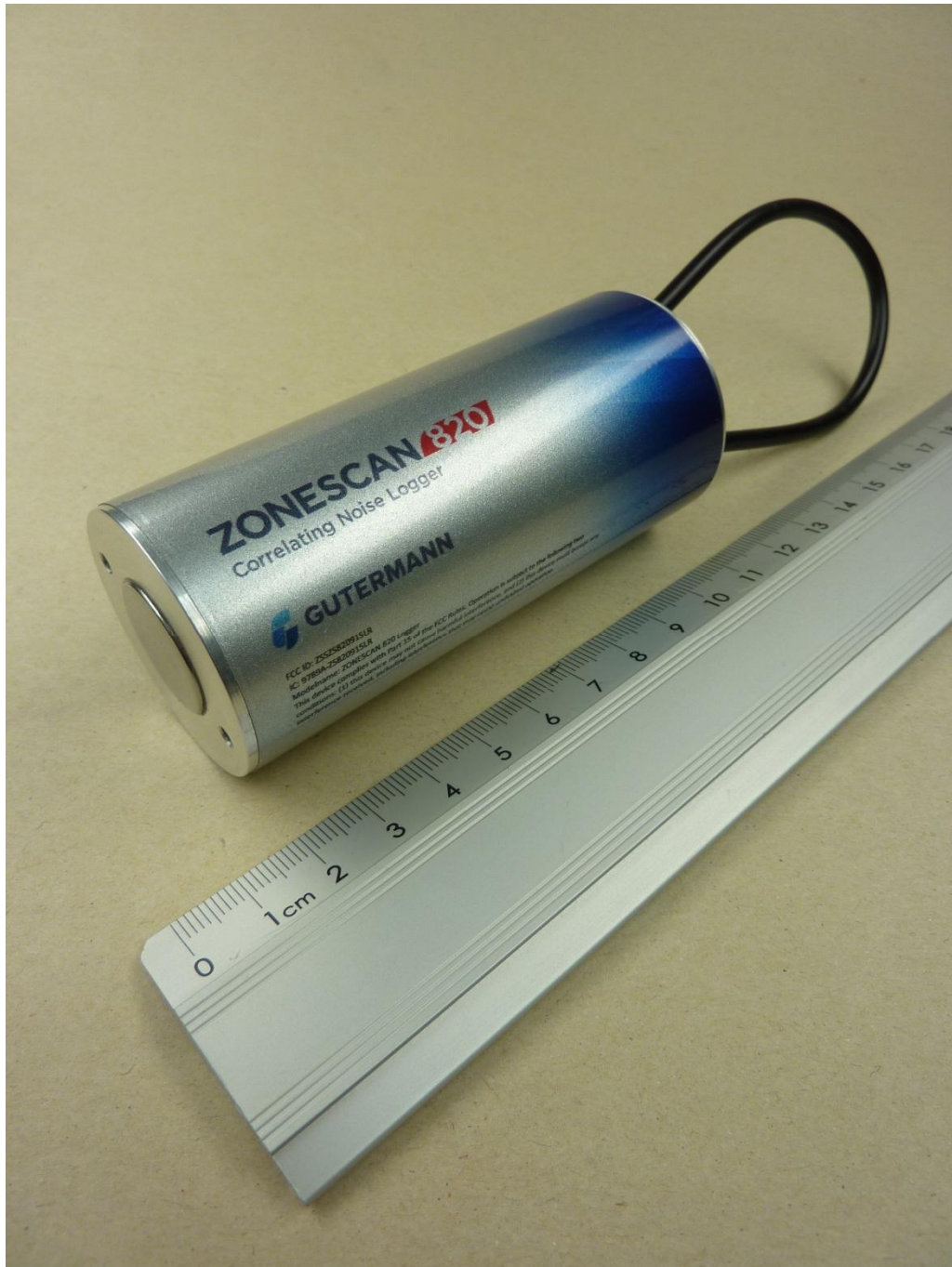
153494_I_U_2.JPG: ZONESCAN 820 Logger with integrated antenna, 3-D-view 2