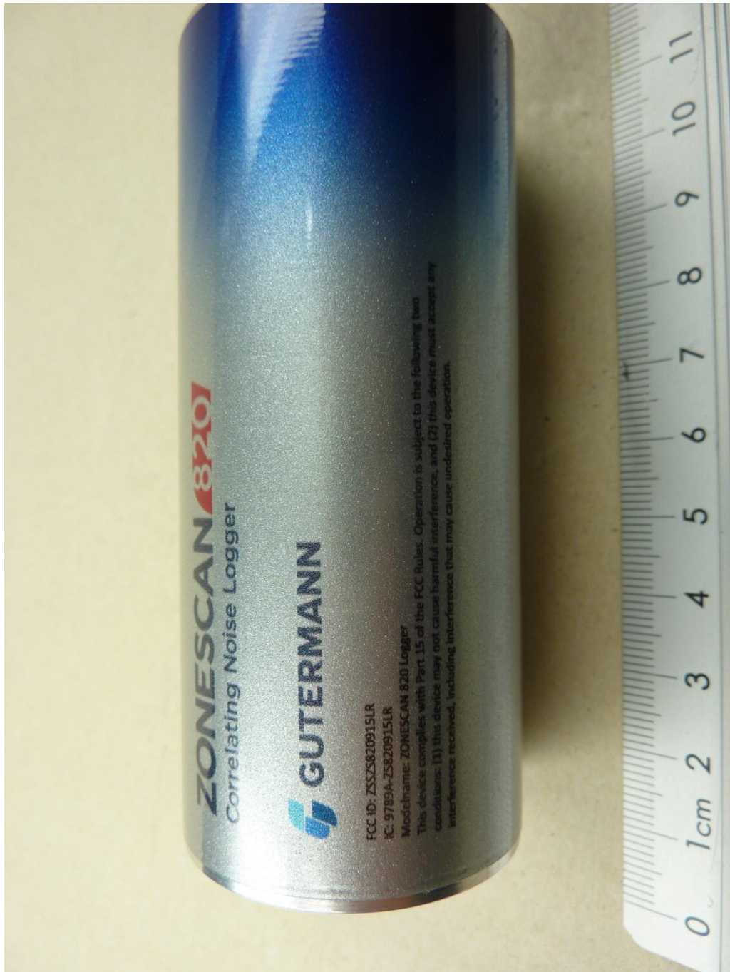
153494_I_U_3.JPG: ZONESCAN 820 Logger with integrated antenna, type plate view