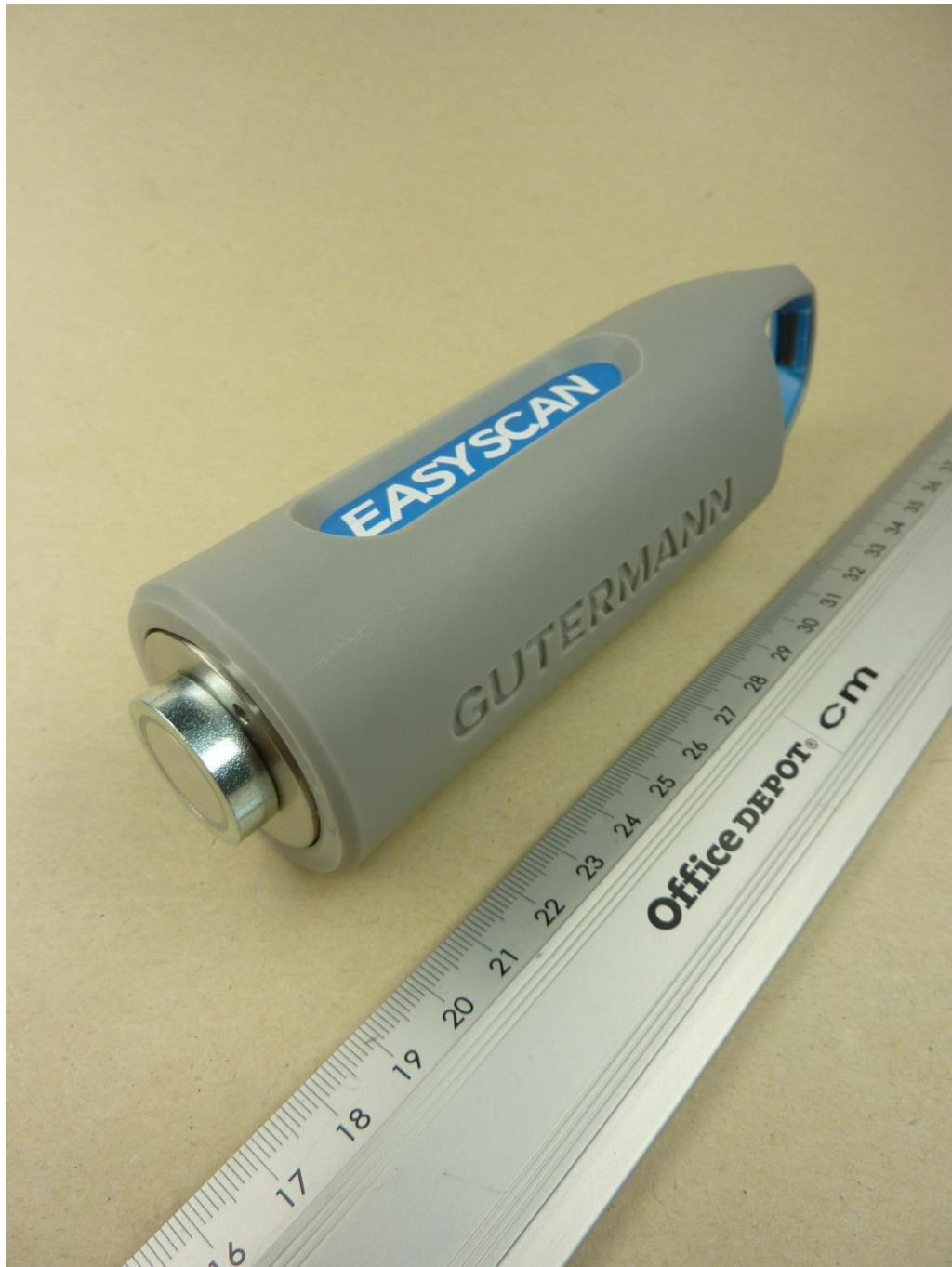
153494_E_U_4.JPG: EASYSCAN SENSOR, 3-D-view 1