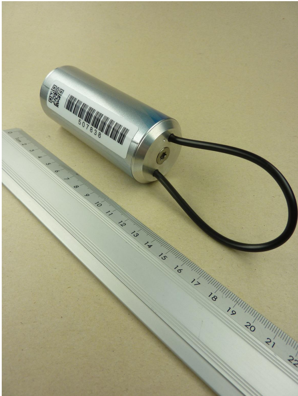
153494_I_U_1.JPG: ZONESCAN 820 Logger with integrated antenna, 3-D-view 1