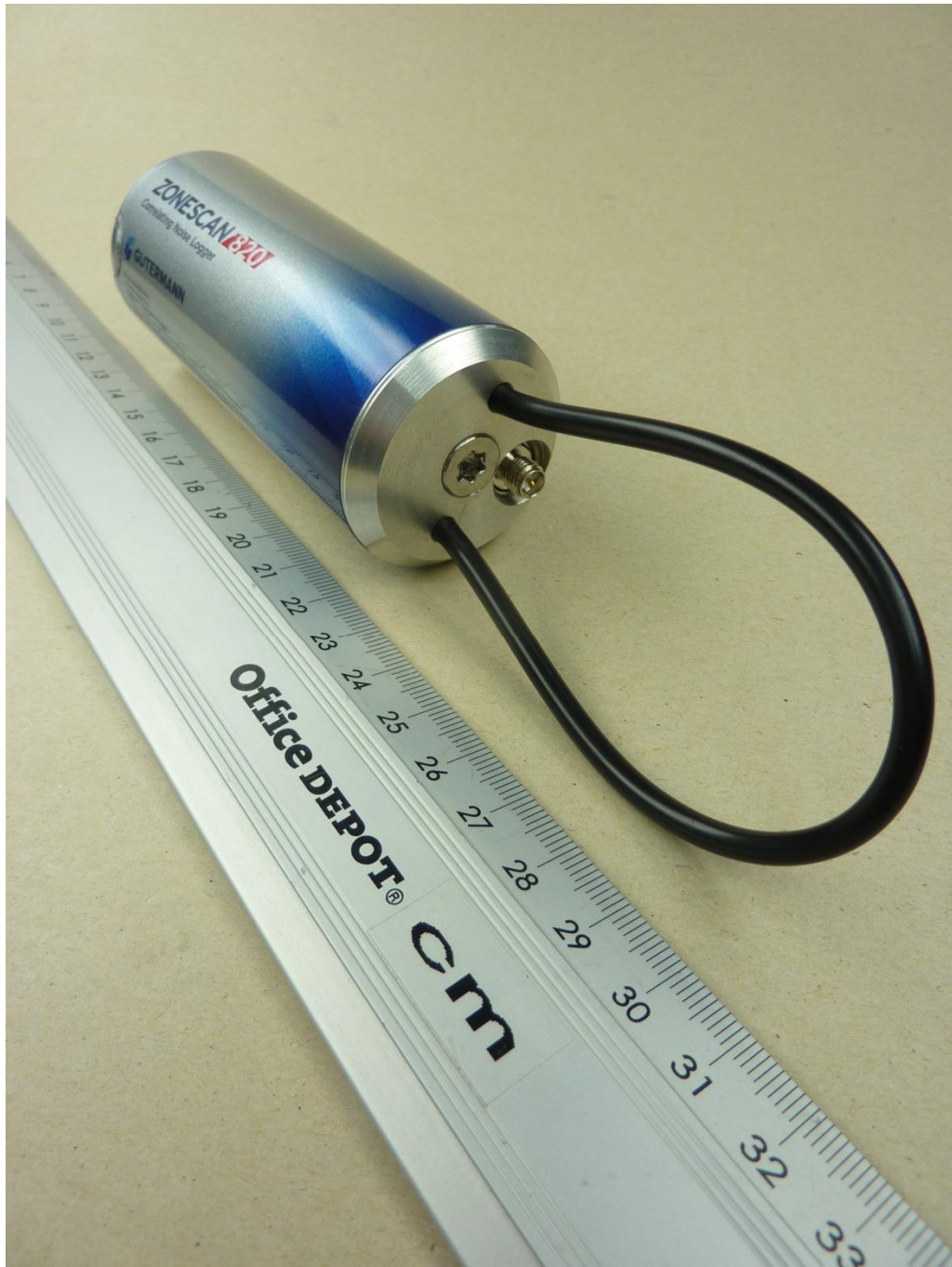
153494_X_U_1.JPG: ZONSCAN 820 Logger with external antenna port, 3-D-view 1