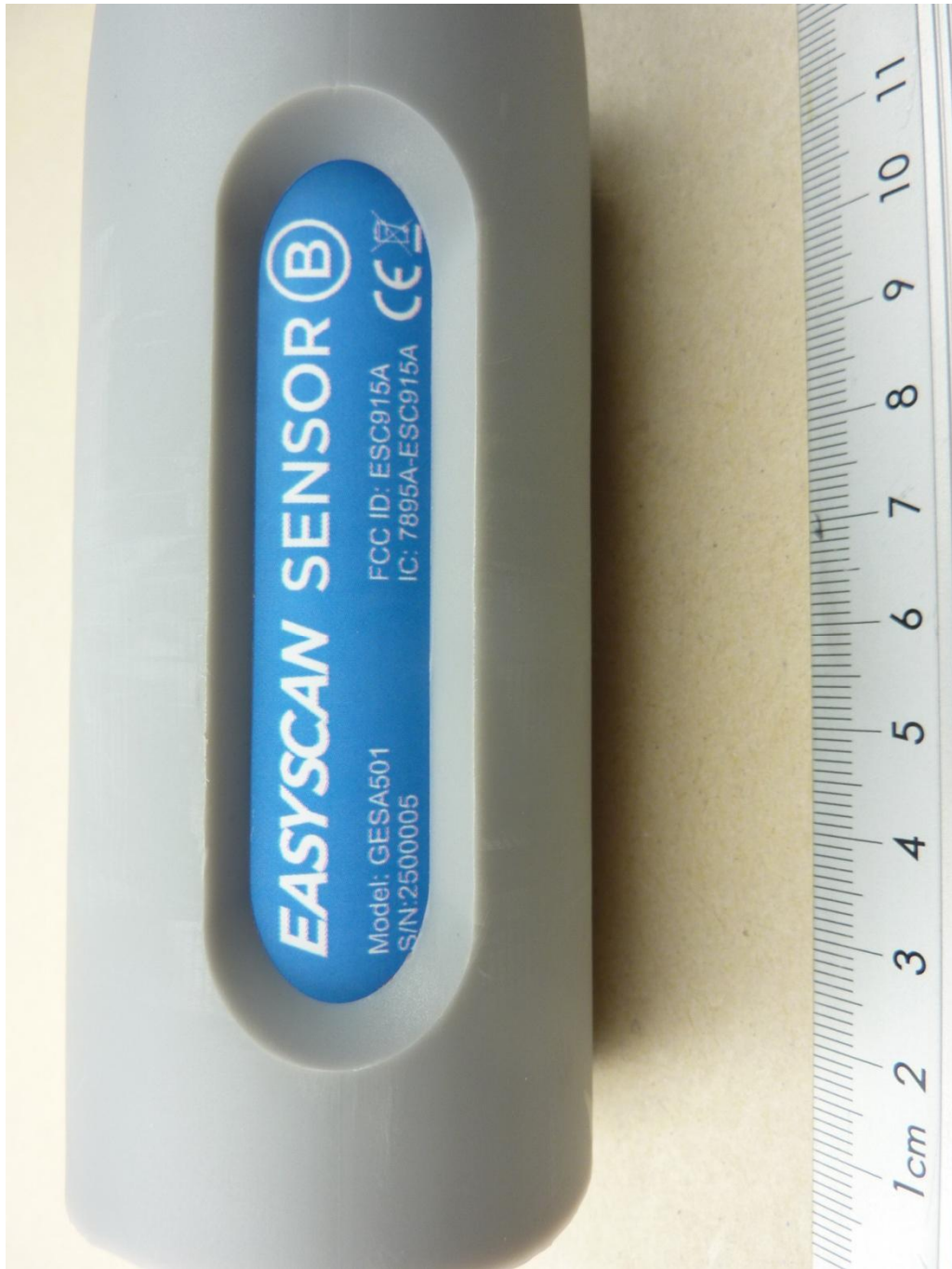
153494_E_U_3.JPG: EASYSCAN SENSOR, type plate view