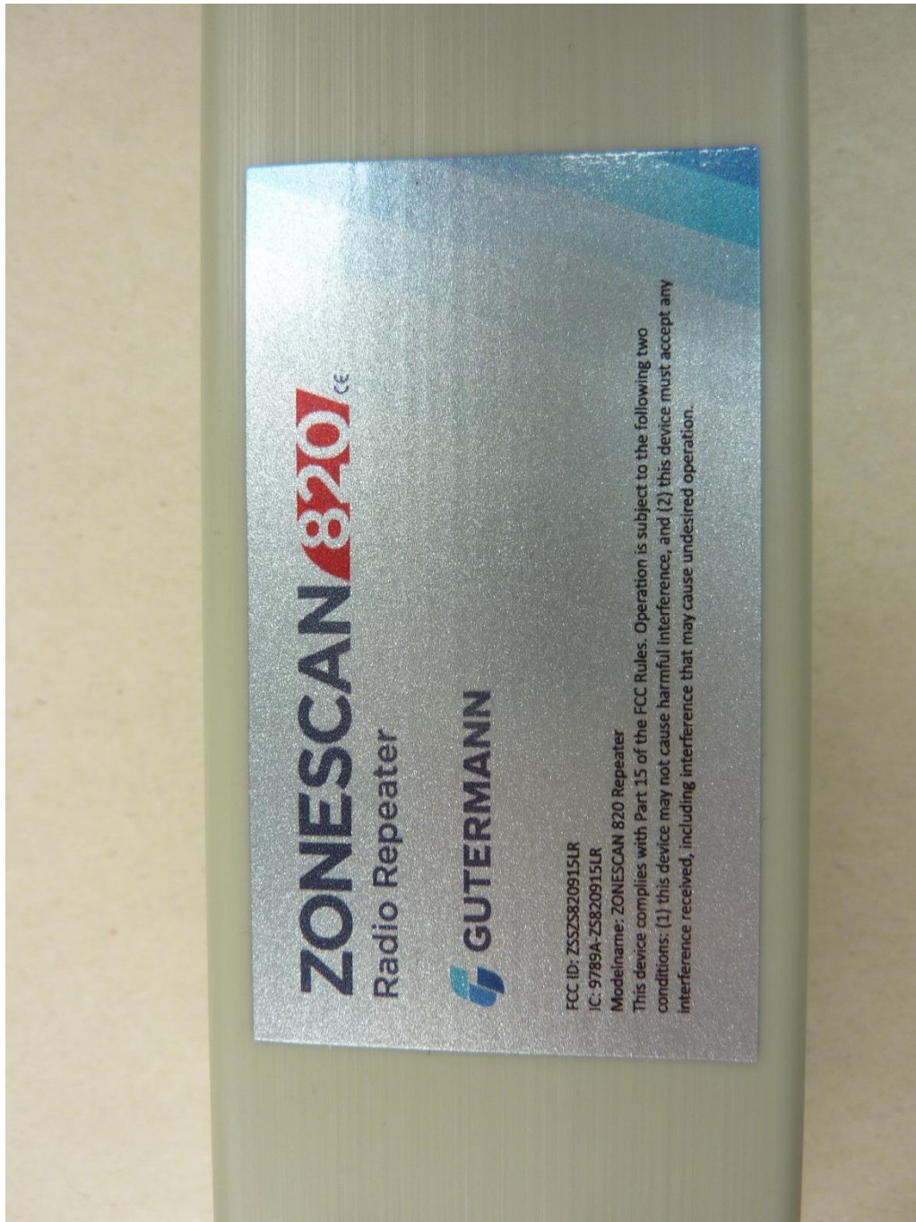
153494_R_U_3.JPG: ZONESCAN 820 Repeater, type plate view