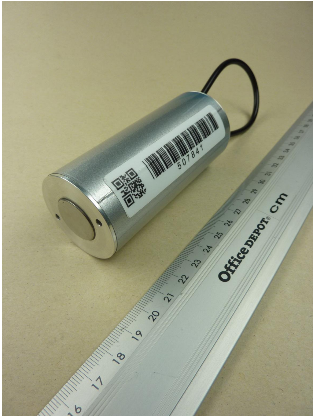
153494_X_U_2.JPG: ZONESCAN 820 Logger with external antenna port, 3-D-view 2