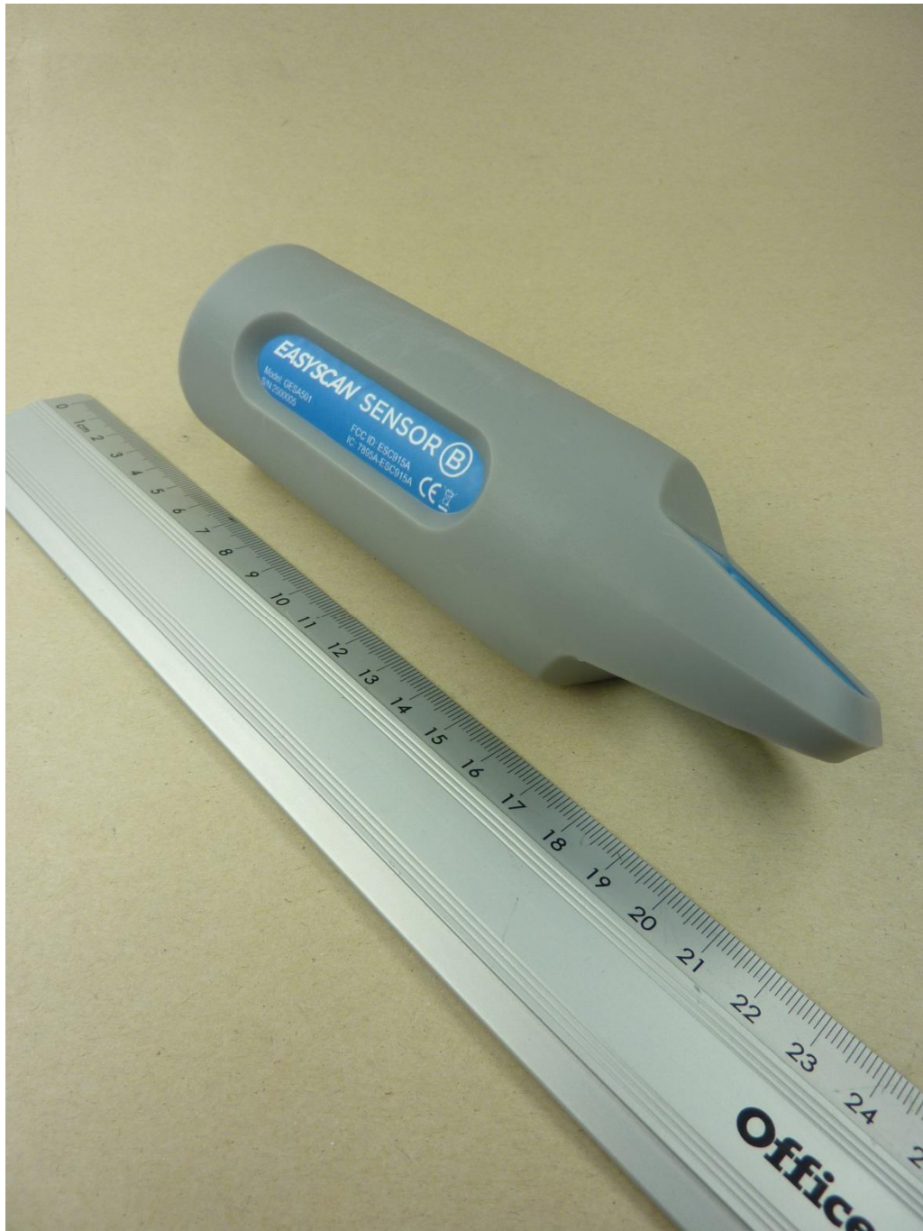
153494_E_U_2.JPG: EASYSCAN SENSOR, 3-D-view 2