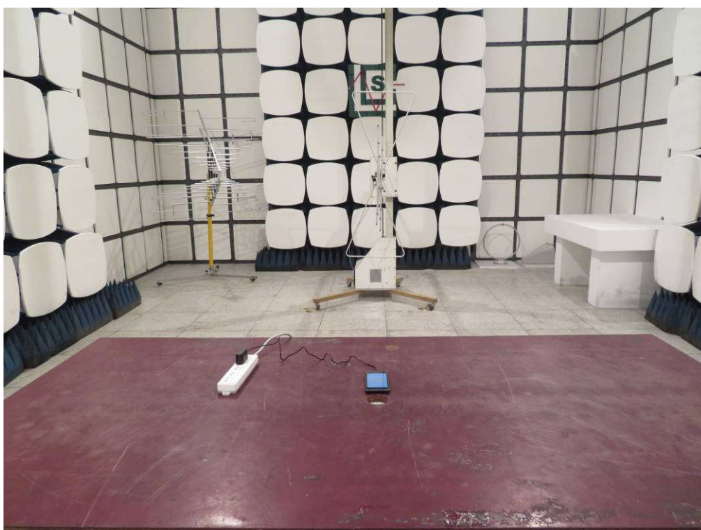
Spurious Emission below 1GHz