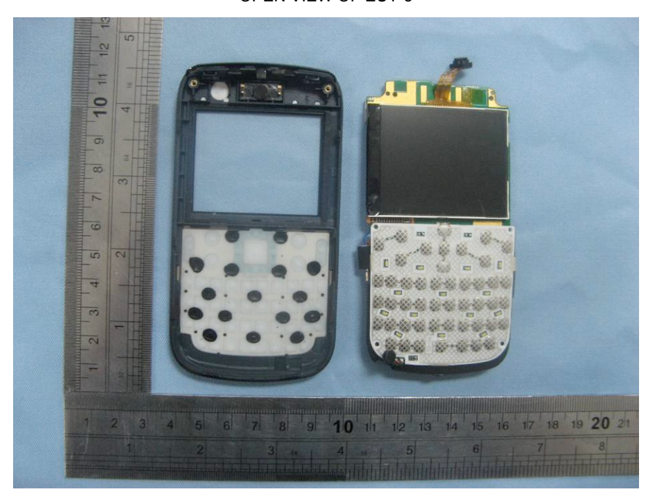
INTERNAL VIEW OF SAMPLE - 1