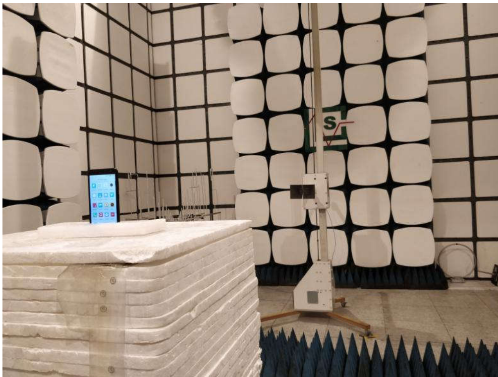
Spurious Emission above 1GHz