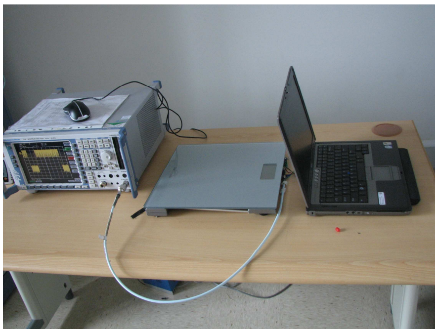
Photograph 1: Set-up for Conducted Emissions at Antenna Port