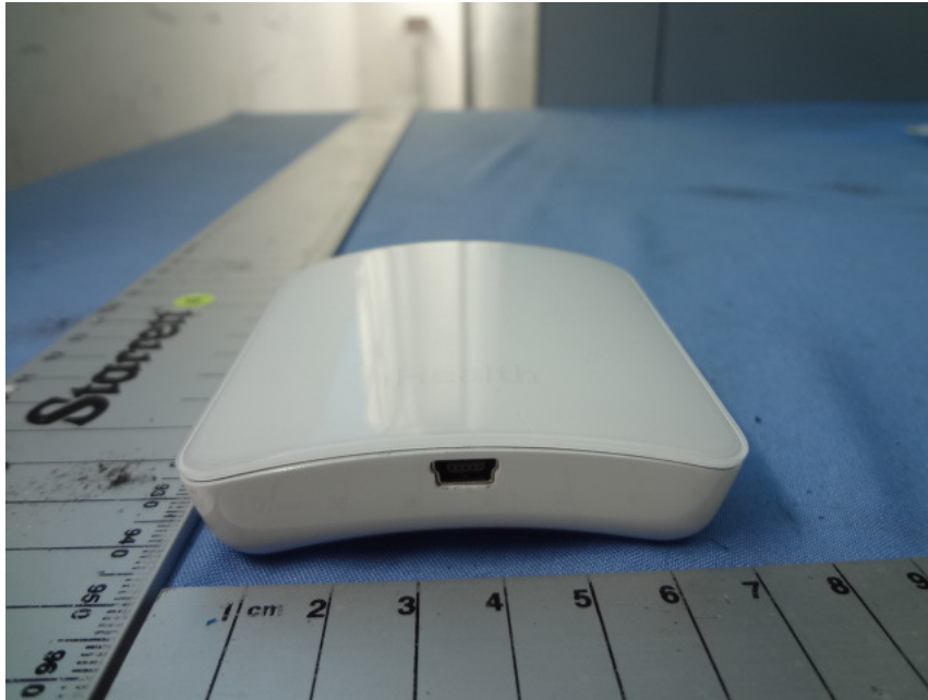
Charger Port View