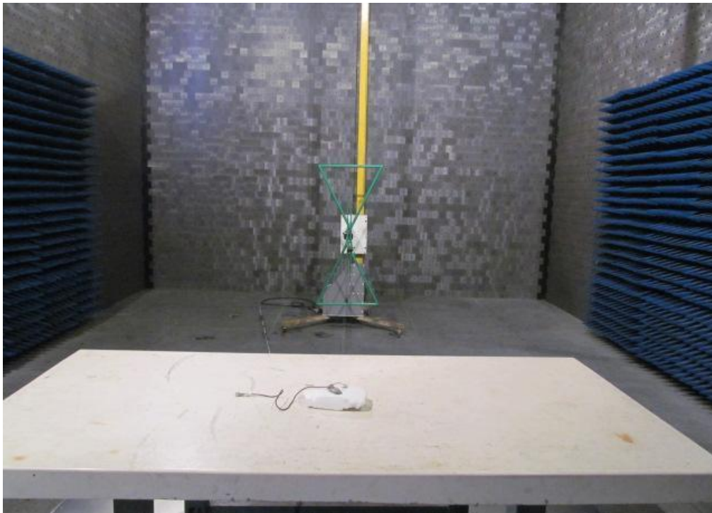
Photograph 1: Set-up for Radiated Emission, 30MHz-1000MHz