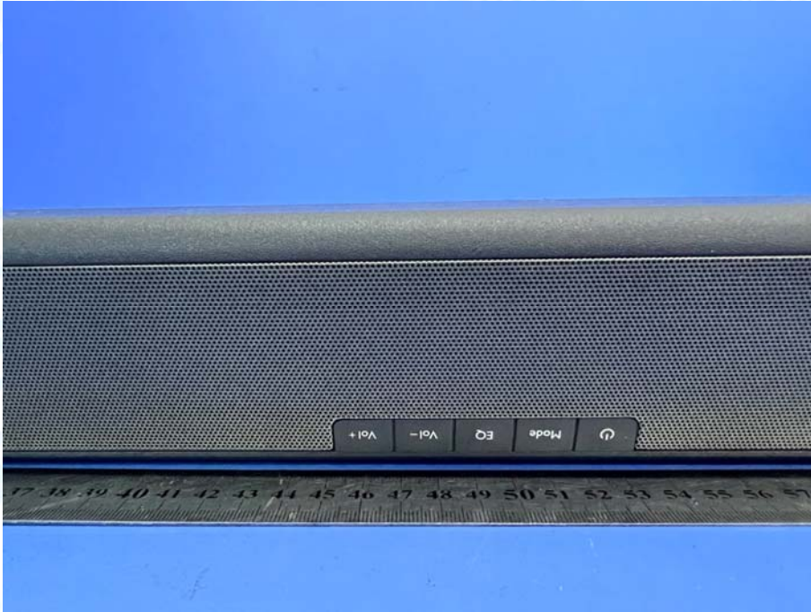
Photo 4 Appearance of EUT