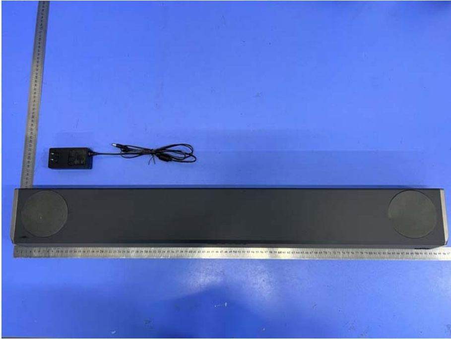
Photo 2 Appearance of EUT