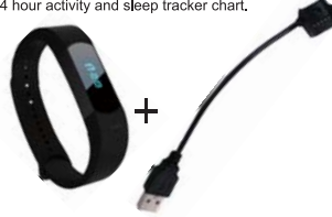
Chart your quality and length of sleep. Wakes you gently with silent "Buzz" alarm feature. 24 hour activity and sleep tracker chart.