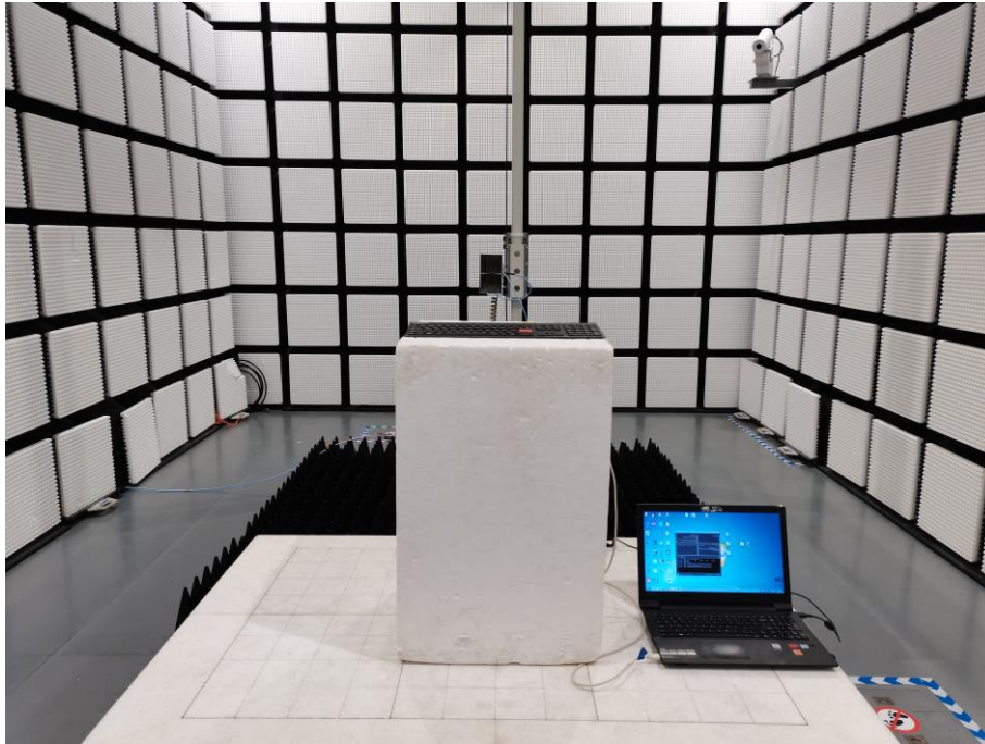
Fig. 3 Radiated emission setup photo(Above 1GHz)