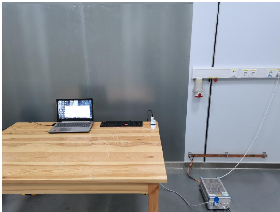
Fig. 4 Power line conducted emission setup photo