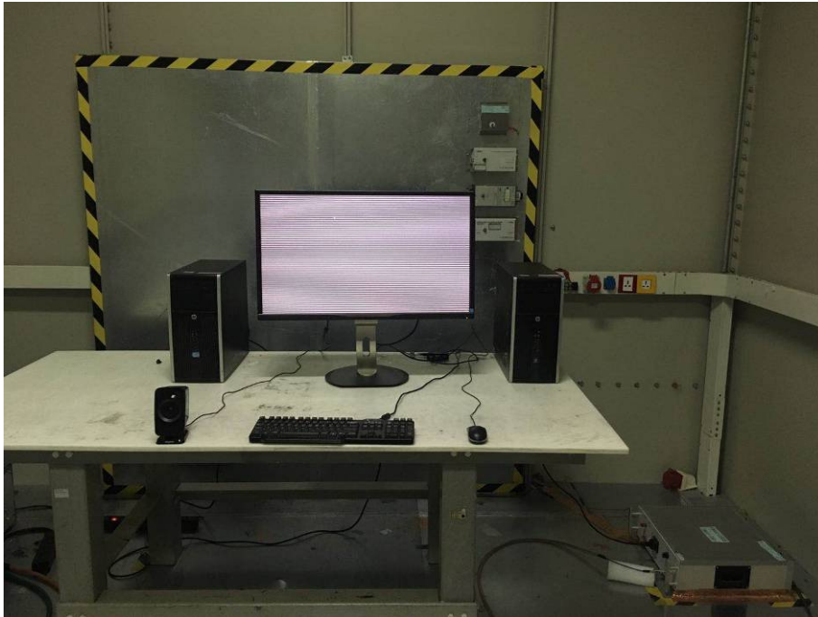
Back View of Conducted Emission Test