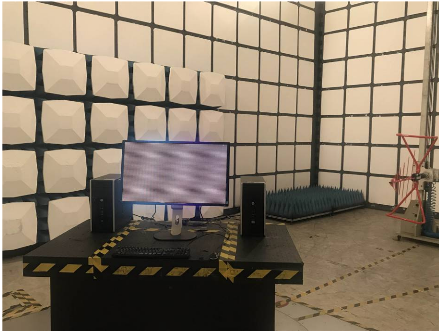
Back View of Radiated Emission Test (30MHz ~ 1GHz)