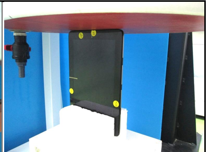
Right Side of EUT with 0 cm Gap