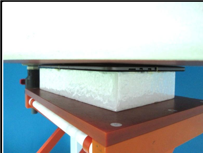
Rear Face of EUT with 0 cm Gap