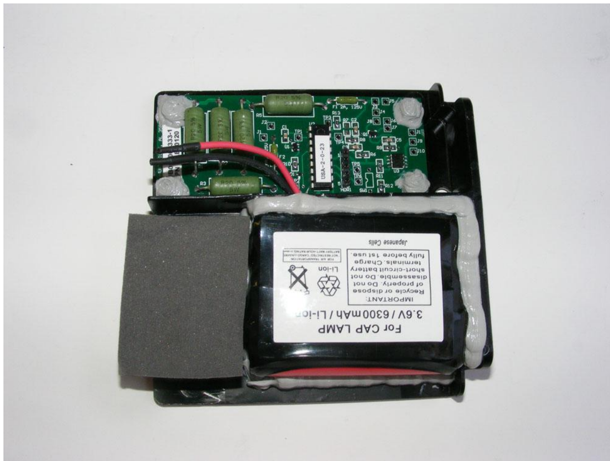
Underground PAD – Internal Photo Battery and Battery Interface Printed Circuit Board