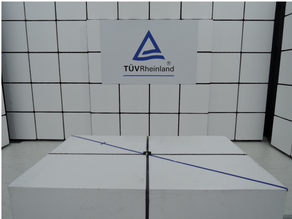
Photograph 1: Set-up for Spurious Emissions (Front View)