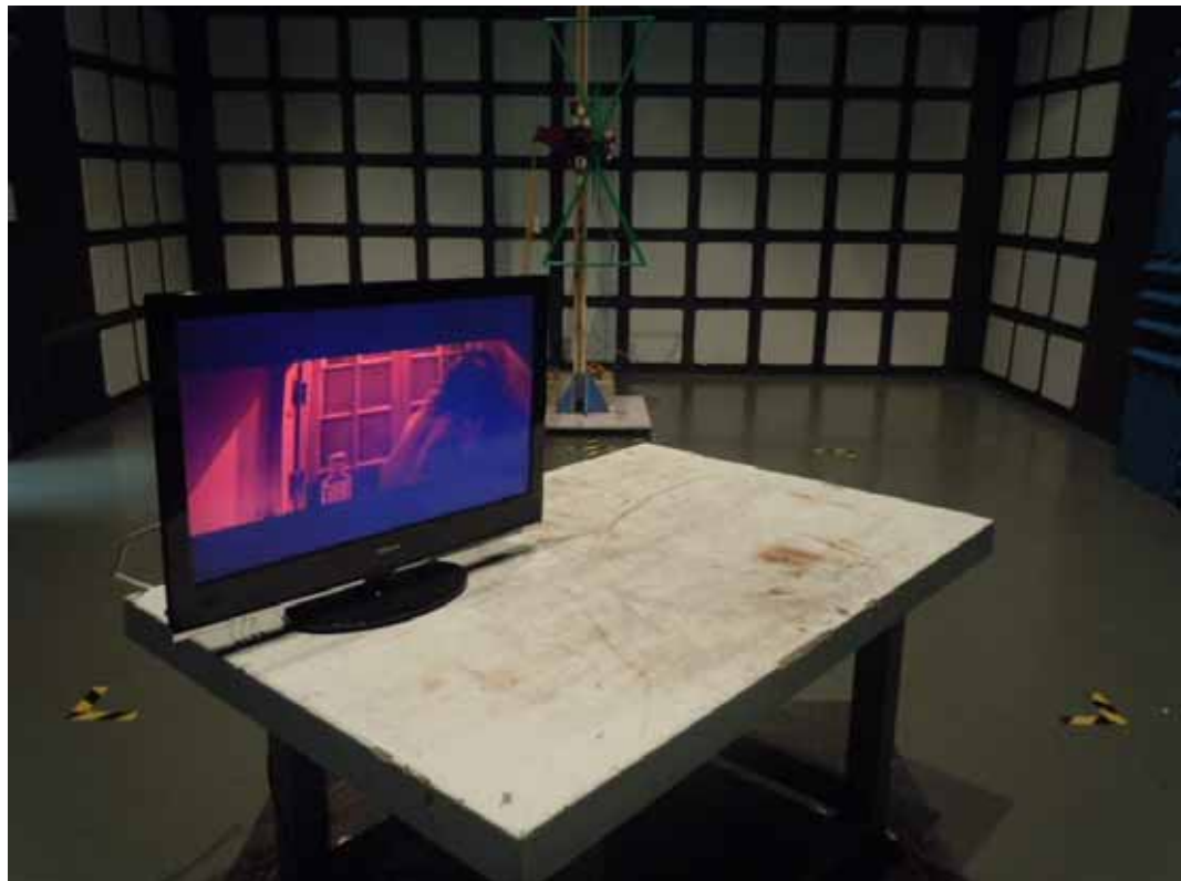
SETUP WITH MAXIMUM DETECTED EMISSION AT VERTICAL POLARIZATION (S/N: E1108987-01/02)