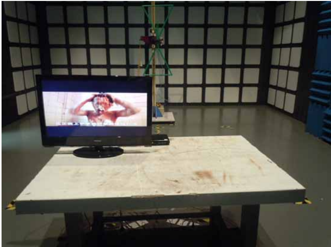
FRONT VIEW OF RADIATED EMISSION TEST