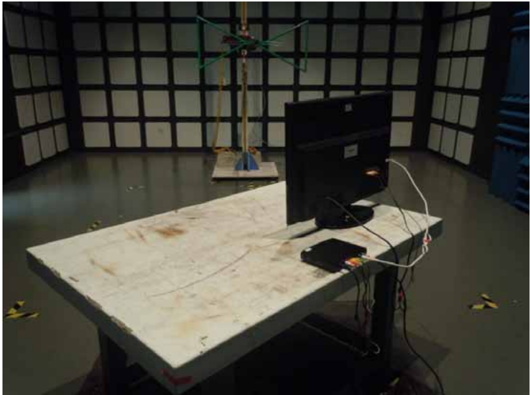
SETUP WITH MAXIMUM DETECTED EMISSION AT HORIZONTAL POLARIZATION (S/N: E1108987-01/02)