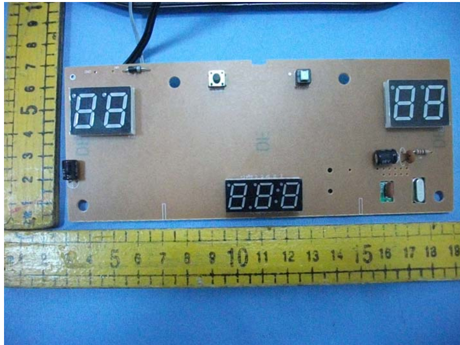
Figure 6 PCB of the EUT-Front View (Receiver Module)