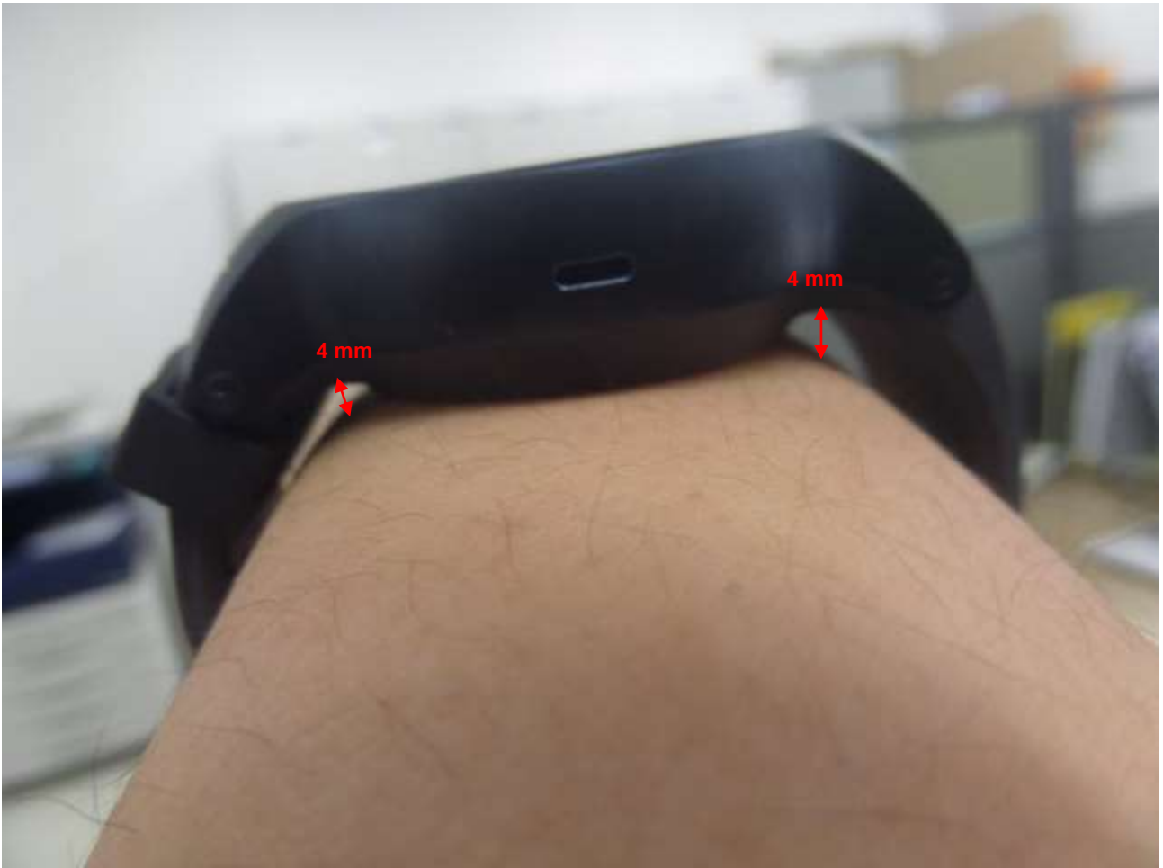
[DUT actual use condition with gap at hinge]