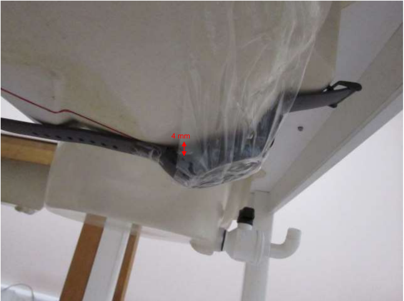
[Distance of 0 cm : the back side for Antenna 1, with gap at hinge]