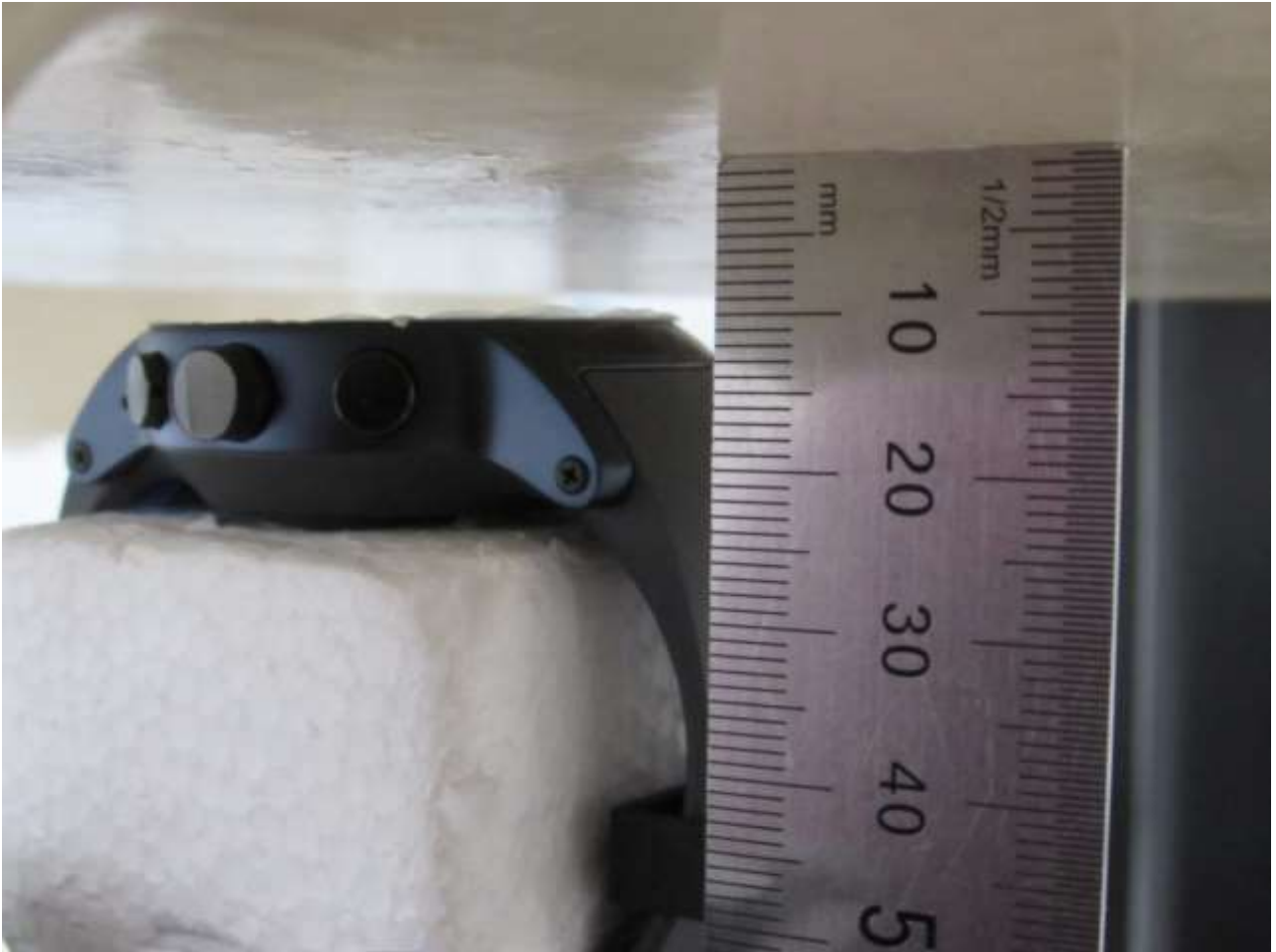
[Distance of 1.0 cm from the EUT]