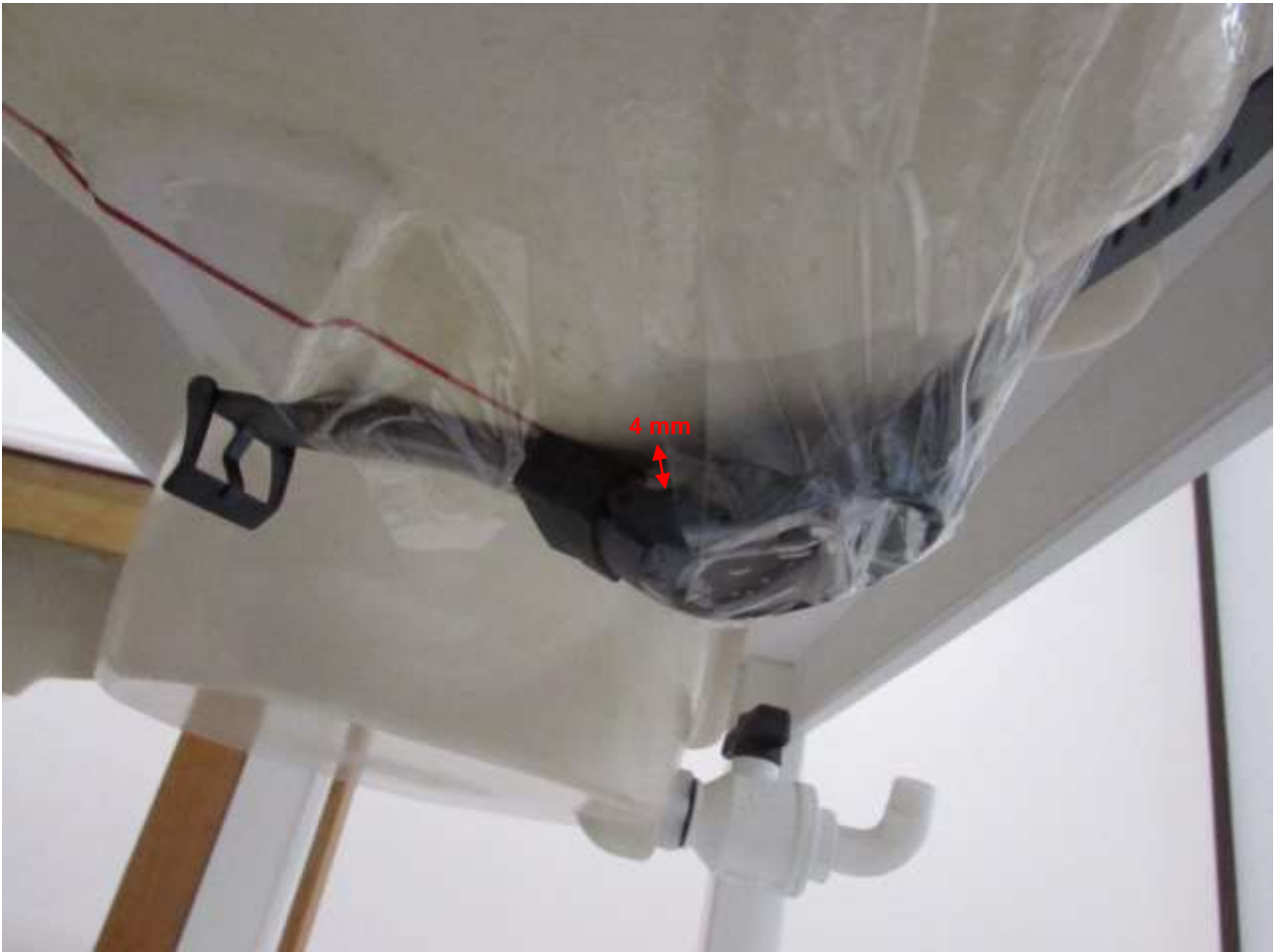
[Distance of 0 cm : the back side for Antenna 3, with gap at hinge]