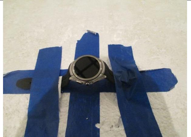
ANTENNA PORT CONDUCTED PHOTO